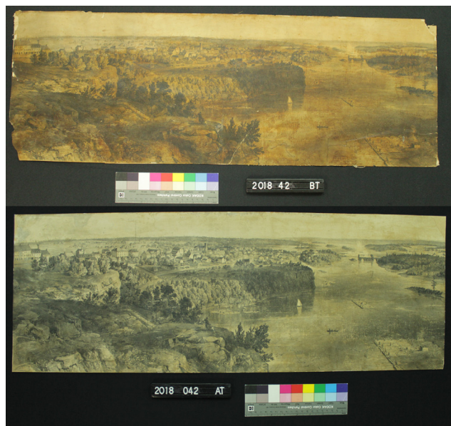
Fig. 10. An 1855 print of Ottawa prior to and after treatment

print was as successful as the Ottawa's 1855 transformation from rough to charming (fig. 10).