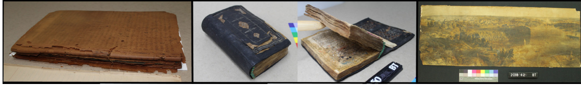
Fig. 1. Left to right: A 20th-century Punjabi manuscript, a 17th-century Qur'an, and a 19th-century print of Ottawa

Each page of the manuscript was laid on a blotting paper and carefully doused with acetone applied with cotton balls. The process required two to three applications per sheet (fig. 2). The pages were then transferred to clean blotters and allowed to air-dry. Treating all 240 pages of the manuscript required 8.5 gallons of acetone and produced three-quarters of a large garbage can full of used cotton balls. This part of the treatment was carried out over 4 days.