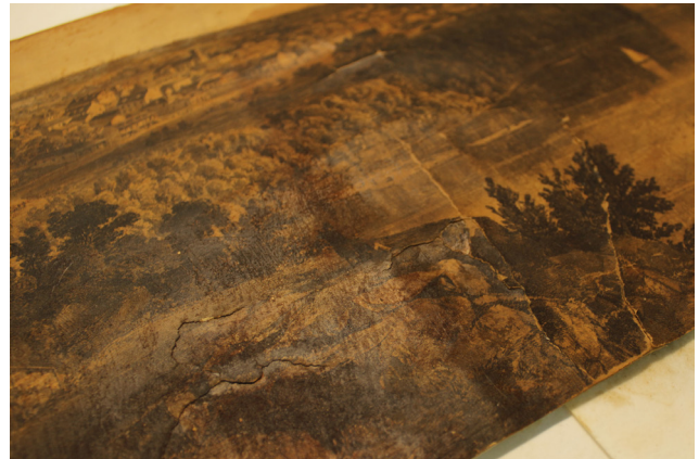
Fig. 9. Print partially cleaned with wetted cotton balls to remove the grime prior to shellac removal

Similar to lifting dirt from a coated painting, cotton balls wetted with warm water were dabbed over the surface, followed by dry cotton balls. The wetting served to slowly dissolve the dirt, which was sucked up by the dry cotton