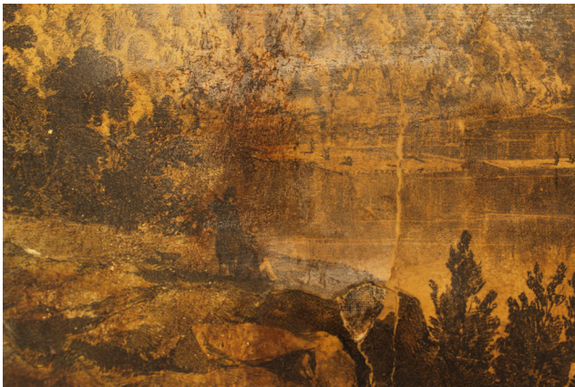
Fig. 8. Close-up image of the grime-encrusted, shellac-coated print

Bathing in room temperature water with a small amount of Photoflo (an emulsifier commonly used in photographic developing) removed the ingrained dirt, and deacidification with calcium hydroxide was carried out in two subsequent baths. The old backing and repairs were removed, retaining the incorrect notation, and the cracks were aligned. A new cotton muslin backing was applied with wheat starch paste, and the print was dried by pressing between blotting paper, followed by infilling of the losses. Any lost media was recreated with Prisma color felt-tipped marker. Treatment finished with hinging the print to an acid-free backing board, with a window mat and a 20-pt board cover that folds backward to accommodate both framing and storage. The transformation of this