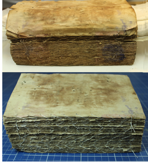
Fig. 6. Original whipstitch next to the recreated whipstitch

A new cover was constructed from acid-free binders board and covered in black, Moroccan-textured calfskin, which closely matched the remnants of the original binding. New endpapers were affixed, and the new cover was attached in a case-bound fashion. The case binding was employed to keep the rebinding obvious, allow for future incorporation of an Islamic binding if desired, and keep the costs down while allowing for the renewed use by the owner. The remnants of the original binding and original endpapers were humidified and stretched before being incorporated into the new binding, ensuring their association with the textblock. For this book, the case binding