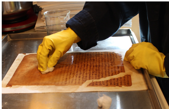
Fig. 2. Using acetone-soaked cotton balls and blotting paper to wick out camphor oil

As the treatment was completed, a chance meeting with Gus Shurvell of Queen's University at the Canadian Association for Conservation of Cultural Property's annual conference in Edmonton confirmed the success of the treatment. Gus generously offered to perform tests through Queen's University's FTIR equipment. Disassociated fragments, both treated and untreated, were sent. The results of the tests were inconclusive, although the results combined with the historical research indicated that camphor oil was