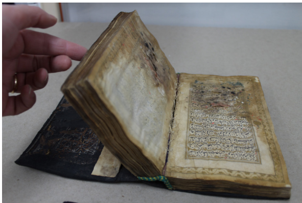
Fig. 5. Blocked Qur'an prior to treatment

18th century, as was the hand-painted decoration found on the endpapers (Jacobs 2008). The hand-sewn whipstitch technique was more commonly applied to more substantial books but was a popular technique applied in the Middle East during the 1600s (Jacobs 2008).