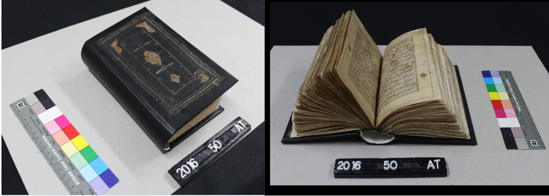
Fig. 7. Qur'an after treatment

with grime, and featured many cracks (fig. 8). Several crude repairs were present on the verso, including strips of cloth and newspaper adhered with a protein-based adhesive.