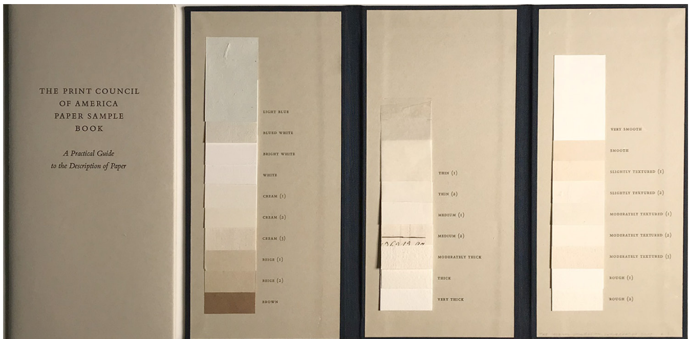
Fig. 2. The Print Council of America Paper Sample Book: A Practical Guide to the Description of Paper . Paper samples demonstrate variances in color, weight, and texture of paper (Lunning and Perkinson 1996).

The behavior of mediums is greatly influenced by this quality of paper. Very smooth surfaces allow for even washes of wet mediums and straight unbroken lines of dry mediums. In contrast, rough surfaces often collect dry mediums at the high points of the paper and leave voids in the deeper profile. Wet medium applied in a dry brush manner may