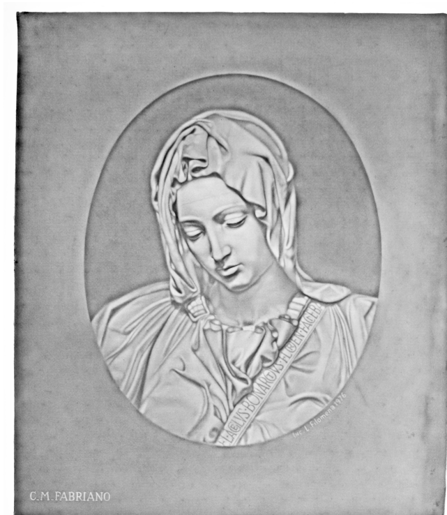
Fig. 1. A sheet of Fabriano paper with light-and-shade watermark, in transmitted light (Baker 2010, 107).