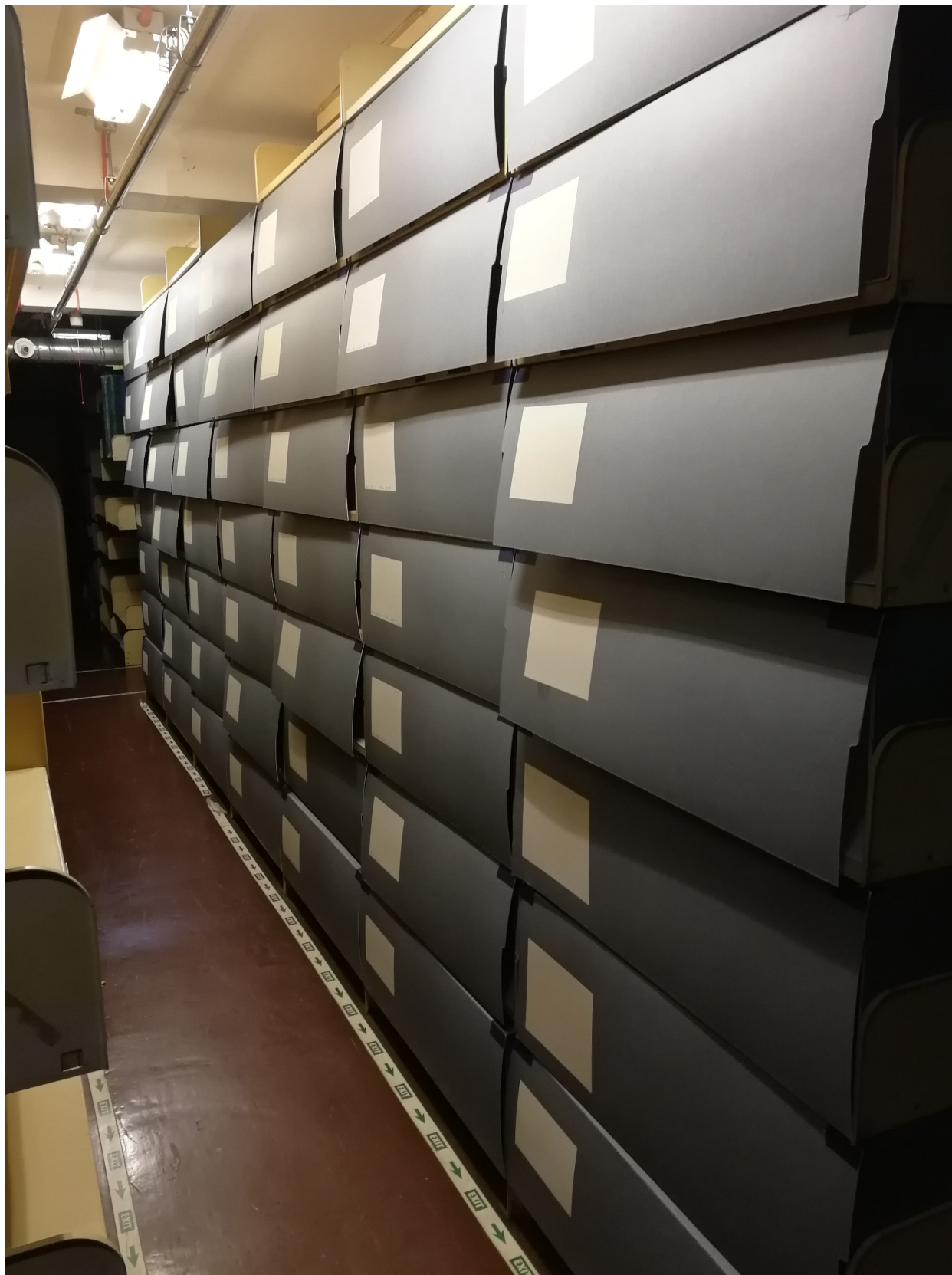
Fig. 3. Stack storage at the Library's George IV Bridge building.