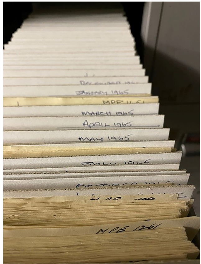
Fig. 4. Treatment cards, created before switching to digital record-keeping, are now kept in storage and in the process of being digitized and added to TNA's database. Reproduced with permission from The National Archives. For permission to reuse, please contact The National Archives' Image Library.

As a result, volumes have been conserved “on demand,” generally only undergoing minimal treatment—the basic intervention that would allow a user to safely access the resource (fig. 3). Most of these interventions, especially the early ones, were either never recorded or bulk records were created with only basic information included. Often these bulk records proved unreliable for research and data-gathering purposes, as they contained dates and names relating to the conservator creating the record, sometimes a different person from the one who had actually performed the treatment. The implications of having little access to the treatment history of these volumes means that conservators have to make assumptions based on historical knowledge of treatments common at