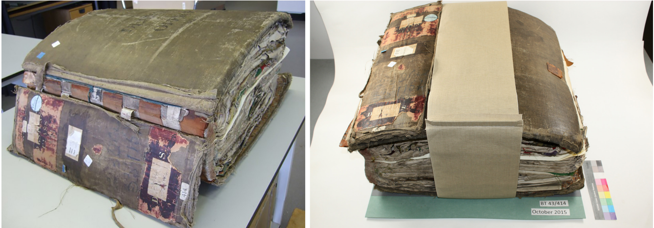
Fig. 3. BT 43/413. This volume received basic stabilization interventions, allowing it to be handled and viewed by readers. Reproduced with permission from The National Archives. For permission to reuse, please contact The National Archives' Image Library.