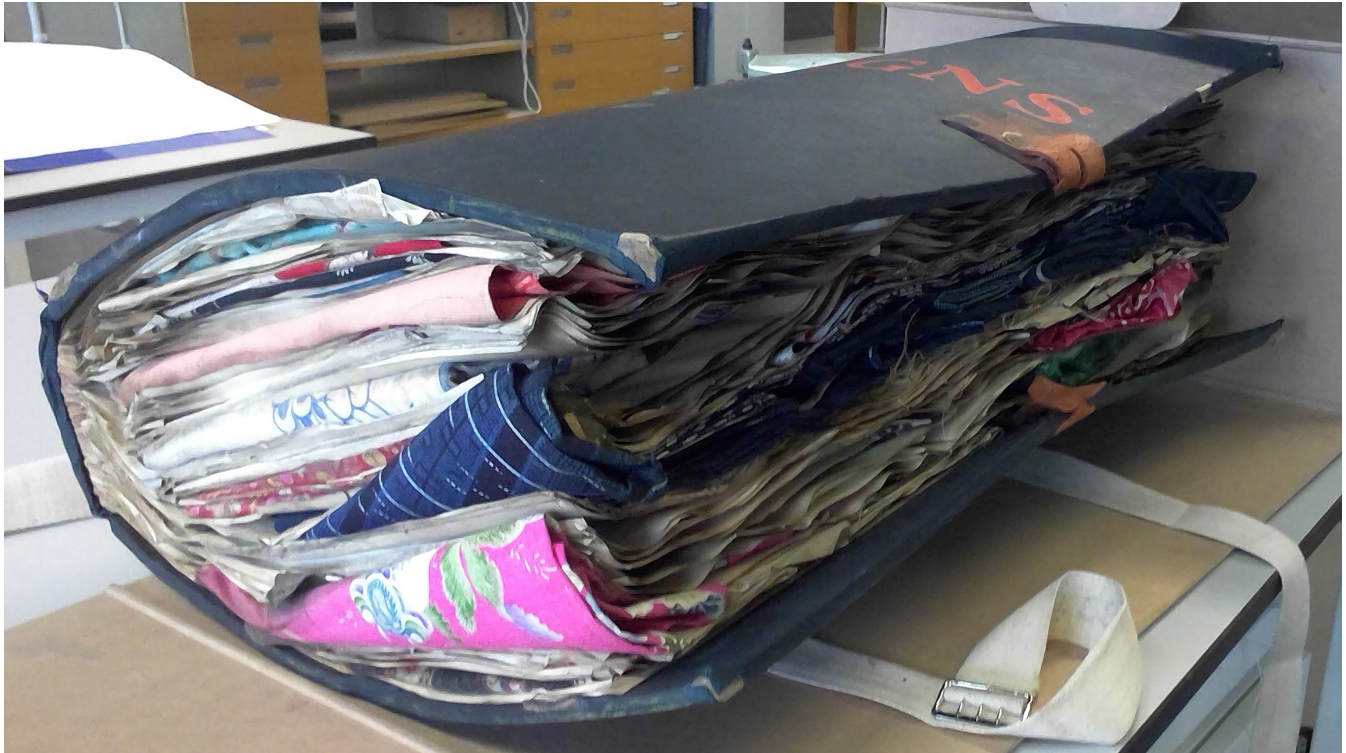
Fig. 2. BT 50/536, one of the volumes for textiles representations. These volumes are among the most challenging because of their weight and size.

of the representation, are particularly complex and vulnerable; they might contain drawings, tracings, photographs, textile samples, lace, and/or 3D objects, all contributing to the instability of the binding and the deformed shape that characterize most of the collection. Although TNA recognizes that accessibility is the final goal, one potential disadvantage of increasing public awareness of the Board of Trade series is the risk of greater numbers of people coming into the archives to access the physical representation volumes. Under the current system, without transcribed versions of the registers and image availability of each design, production is very resource intensive, requiring unnecessary handling of the representations. For this reason, there needs to be the right balance between greater public engagement and resource availability.