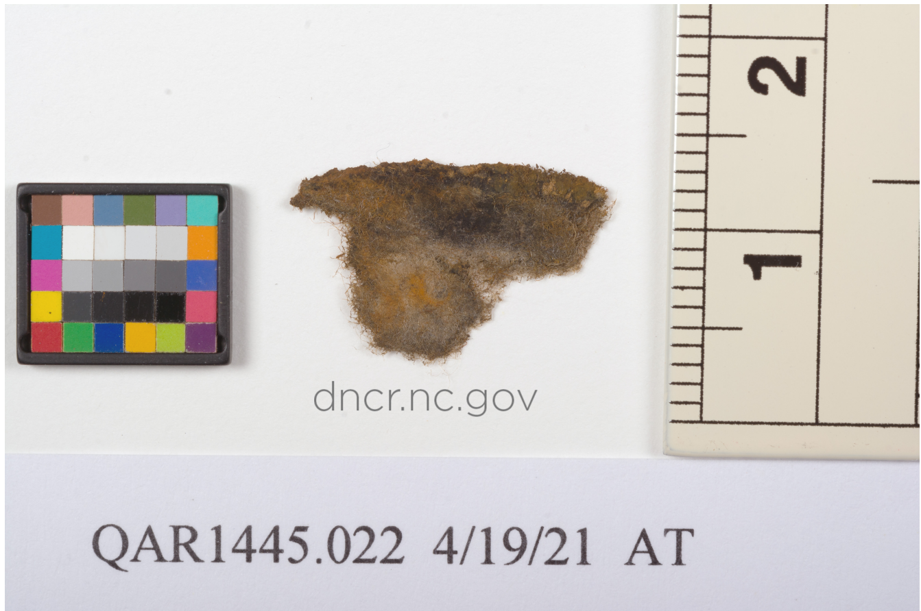
Fig. 9. QAR1445.022 after treatment.

seeking advice on waterlogged paper, both within the United States and abroad. The discovery has also been published in the North Carolina Historical Review (Farrell et al. 2018) and presented at the Nautical Archaeology Society annual conference in the UK.