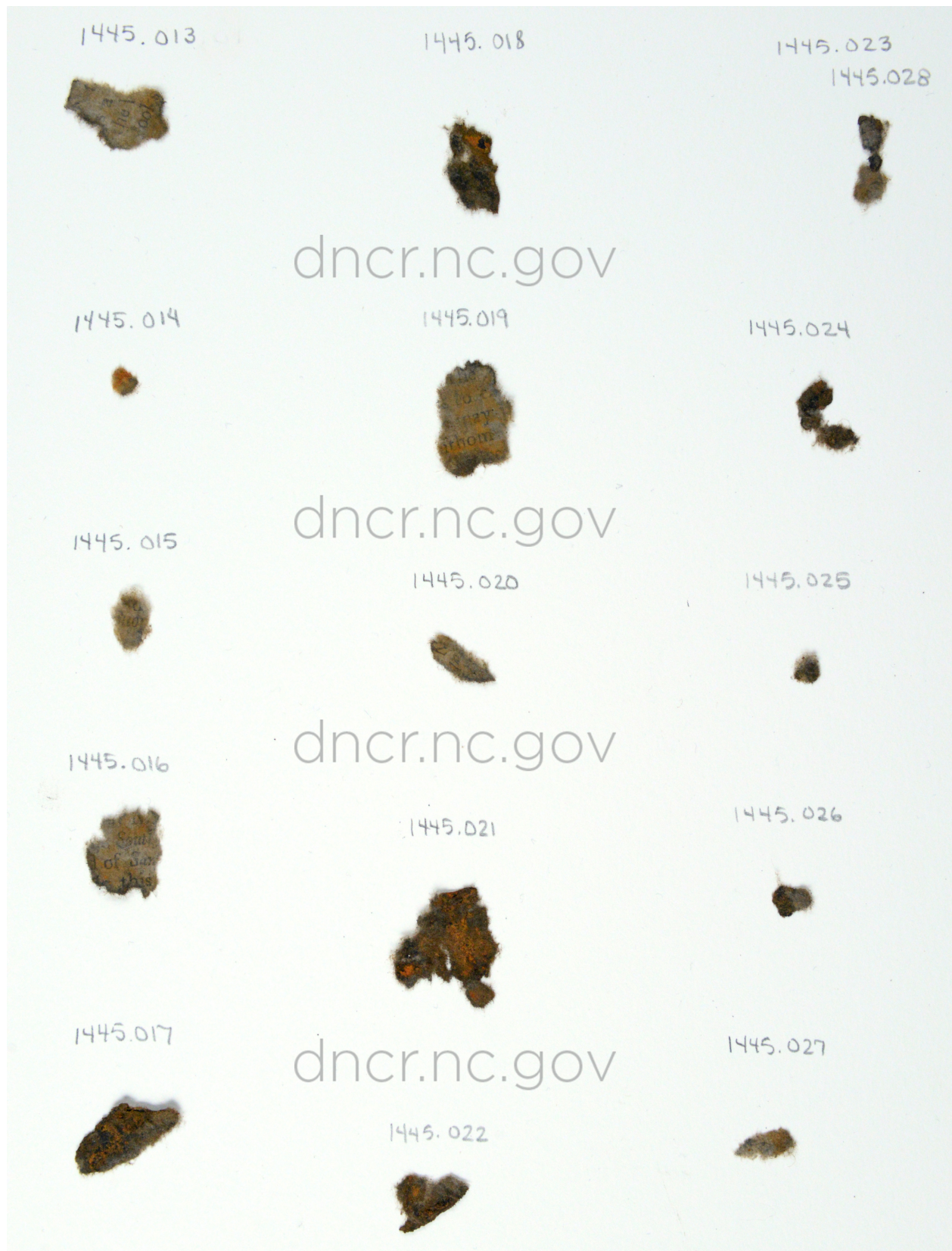
Fig. 4. Sixteen individual paper fragments.