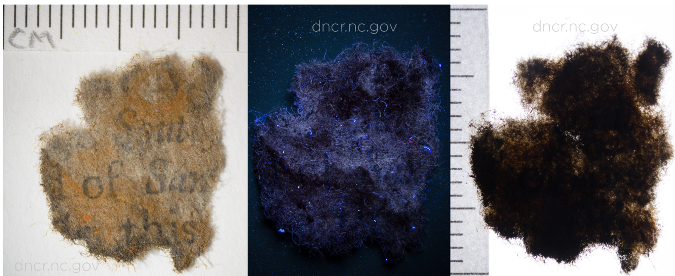
Fig. 5. QAR1445.016 in ambient, UV, and transmitted illumination.

About nine months later, a second set of micro-photographs was taken. These were again designed to capture the condition of the corrosion at that moment in time, and also provided the opportunity to take images of all of the fragments under UV light and in transmitted light. Although most of the fragments appear opaque in transmitted light, the images were still helpful, as they show how thin some areas of the paper support actually are due to loss of fibers. Fragment QAR1445.016 looks fairly complete in ambient light, but in transmitted light it is apparent that the top two pieces on the right and left sides are incredibly thin and almost detached (fig. 5).