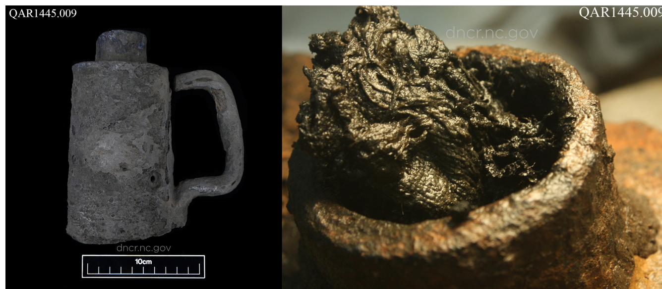
Fig. 2. Cleaned brech block (left) and textile gasket as discovered in mouth (right).

The sealed chamber indicated that the brechblock was still loaded with gunpowder and ready for use at the time of grounding. When the tampion was extracted, roughly woven fabric resembling canvas sailcloth was discovered acting as a gasket to further protect the chamber from water ingress, which would have ruined the gunpowder (fig. 2). The textile then began desalination to prepare it for impregnation and controlled drying. No attempt was made to flatten or unfold