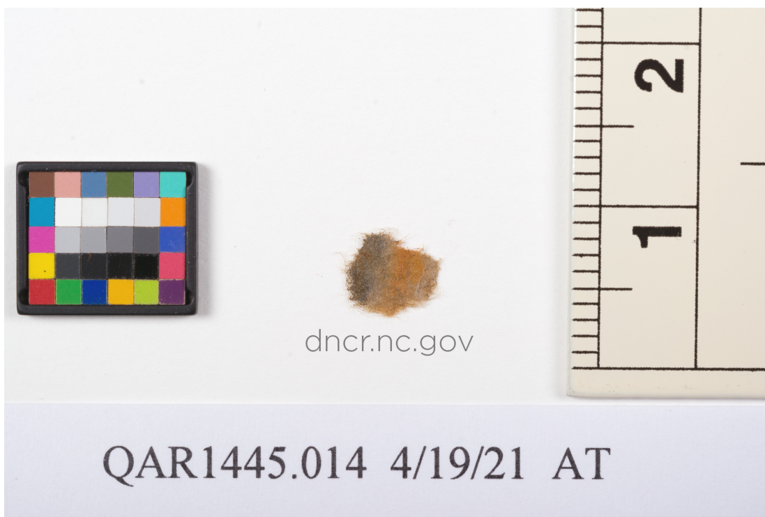
Fig. 8. QAR1445.014 after treatment.