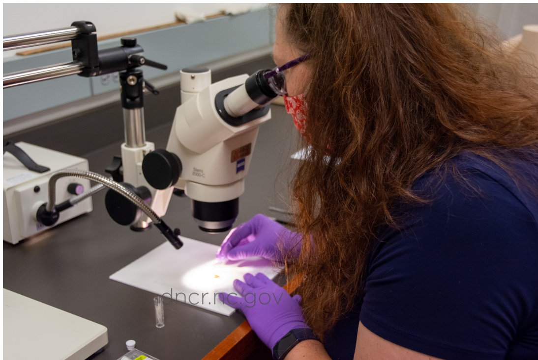
Fig. 7. Applying a 1% solution of Klucel-G in ethanol to QAR1445.022.