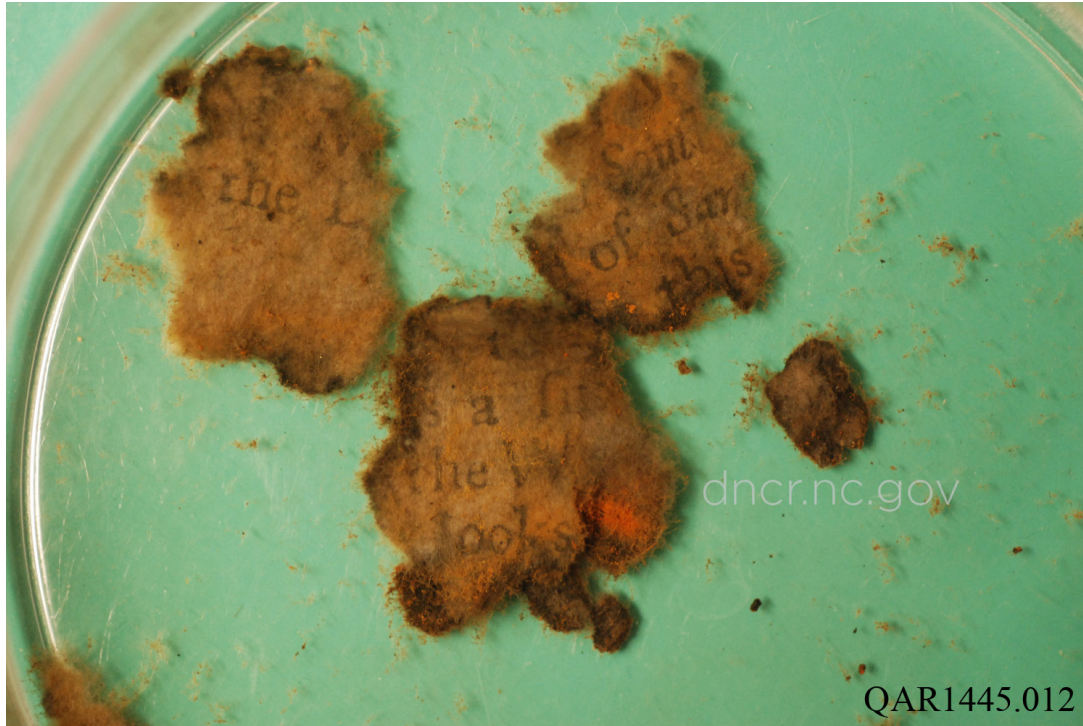
Fig. 3. Printed paper while still wet.

the textile, due to its fragility and retention of the shape of the chamber's mouth. After several months of desalination to remove harmful salts, a secondary material appeared in the water bath alongside the textile. Mild agitation of this extremely delicate mass of fibers revealed fragmentary text, signifying the discovery of printed material. Investigative microscopy confirmed the identity as paper (fig. 3).