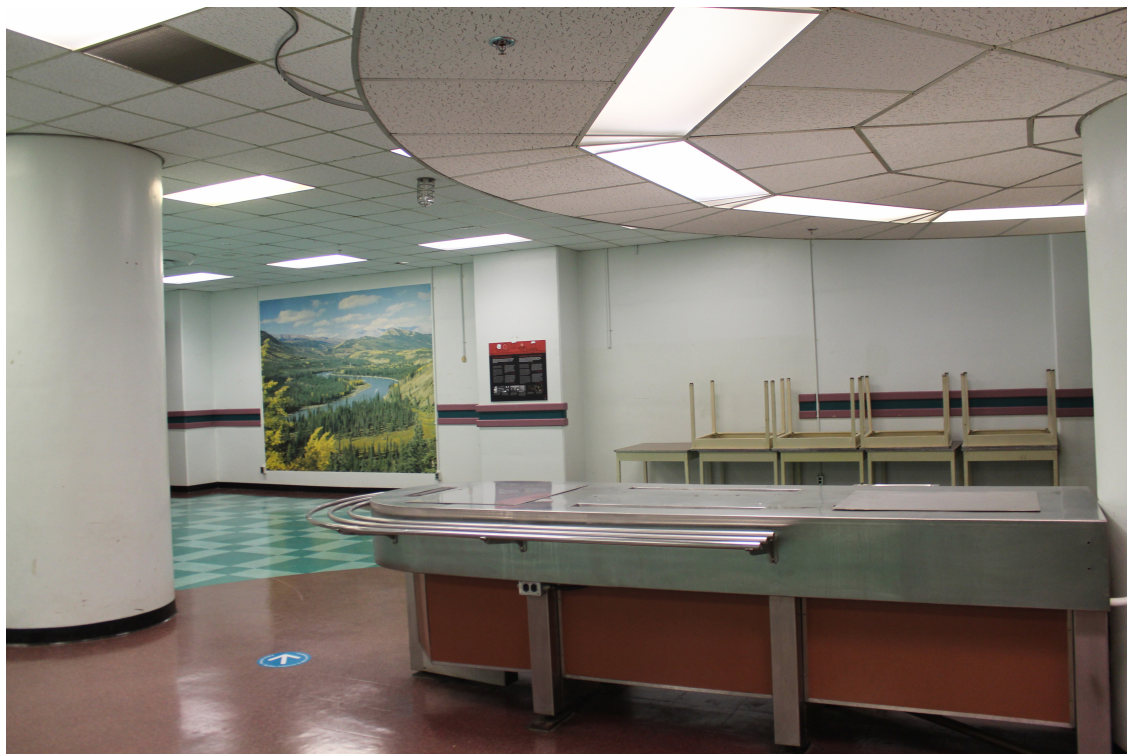
Fig. 6. Bow River mural in the cafeteria.