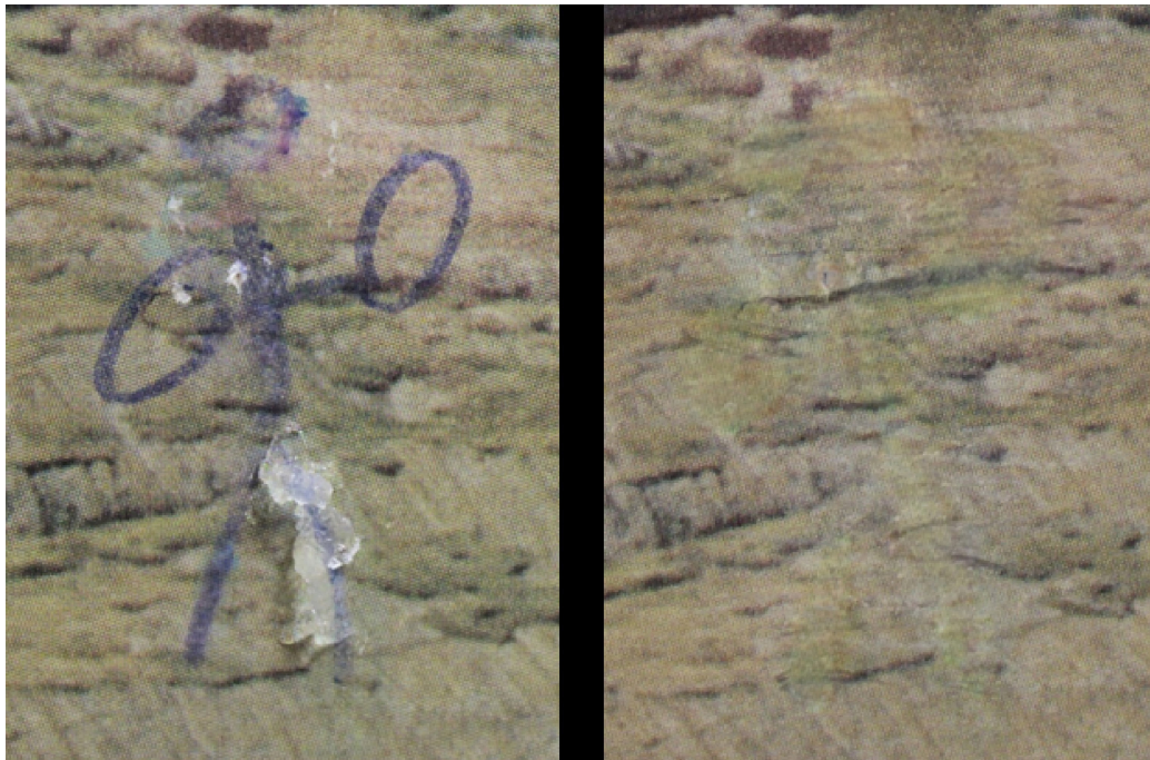
Fig. 9. Before and after removal of stick-figure graffiti.

Once the stains had been addressed, removing the bubbles was the next challenge. The paper had actually expanded in these areas and required shrinking prior to re-adhesion. Evidence of the original rubber-based adhesive was visible at the seam lifts and at small areas along the edges of the printed paper. Rubber-based cement can be reactivated with heat, and heat would also dry and shrink the heavy-weight paper. This approach worked very well for the smaller bulges and the long thin bulges (fig. 10). A hair dryer was set on full blast, and full heat was held fairly close to the wall, and slowly but constantly moved over the bubbles while smoothing them with a Teflon folder. Due to the issues with moisture at the exterior wall, it is likely that this process will have to enter the