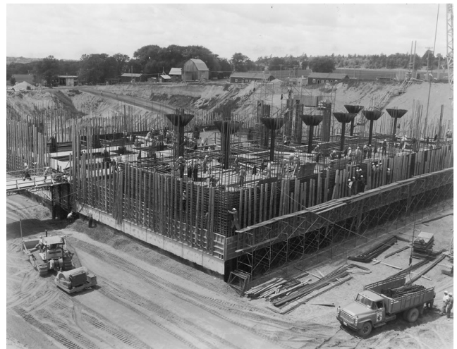
Fig. 1. Construction of the bunker, ca. 1960–1961.

On the surface, the Diefenbunker was an active military facility for 32 years, from 1962 until it was decommissioned in 1994. For that period, there was a staff of 100 to 150 soldiers stationed on a rotational basis for mainly communications purposes (fig. 2). At its height in the 1980s, this site would process up to 100,000 messages per month, each one having