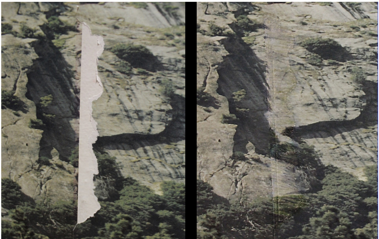
Fig. 12. Before and after infilling loss and inpainting with watercolor pencils.