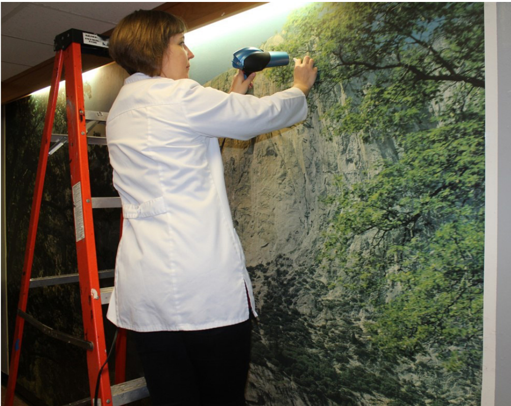
Fig. 15. At work.