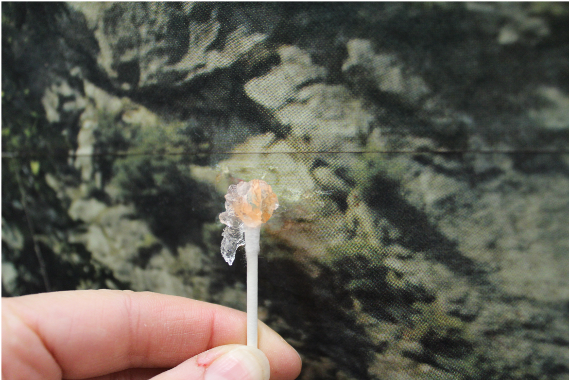
Fig. 7. Laponite on a cotton swab showing products of staining absorbed by poultice.

Neither gellan gum nor agarose gum was going to stay in place on a vertical wall, and methyl cellulose was too wet for most areas. The best solution was to apply Laponite RD to pull out the stains. A synthetic layered silicate product, Laponite RD is commonly used in book conservation to soften and draw out glues, as well as in object conservation for cleaning marble and alabaster. It is well known as a poultice for removing stains on stone. Commercially, it is used in toothpaste, paint, personal care products, and household cleaners (fig. 7).