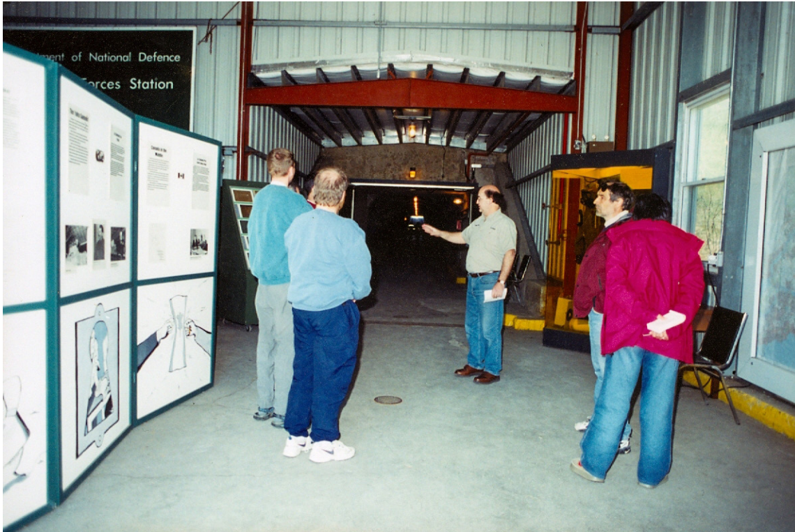
Fig. 4. Tour being given to the public, 2003.

over family and friends could be overwhelming. When the bunker was being constructed, planners partnered with psychologists to design the spaces people would be working in continuously. Because of its confinement, psychologists were inspired by submarine psychology and the extended periods underwater. Striped columns and floors were used, which were intended to trick the mind into thinking the space was wider than it actually was. Desks and chairs were fabricated in cheerful colors like bright orange, yellow, and blue. And finally, starting in the early 1980s, these “windows” were placed in the recreational areas of the bunker to simulate life above ground. Wide open scenes of nature were intended to stave off the monotony of the work and the confinement of space.