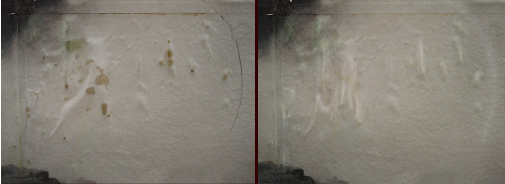
Fig. 8. Before and after stain removal with Laponite.

Laponite is thick, stays in place, and is not as moist as methyl cellulose. It did a brilliant job of dissolving and wicking out the stains. It was applied with cotton swabs, left to sit for one to two minutes, then removed by a cotton swab, and the process was repeated until satisfactory results were achieved. The areas were given a final, light swabbing with slightly dampened paper towels to remove any possible residues (fig. 8).