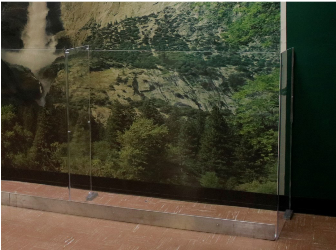
Fig. 13. Barrier showing bent Plexiglas sheets, feet, and kick plate.

Visiting this unique site is always exciting; however, working alone three stories below ground is a challenge. Peace and quiet when conducting a treatment is usually welcome, but the presence of others, natural light, and the ambiance play a huge role in preventing mental strain. The museum's employees all work on the fourth level, which is the top level. They have modern offices, where they grow plants, they have lounges, and many people are milling about and conversing. Although there are no windows, it is not a far walk to take a break outside. These steps have produced a pleasant working space for staff. For a conservator, working in isolation, three stories underground, in an atmosphere that resembles the set of a 1960s horror film, in the midst of a pandemic, the morale is different (fig. 15).