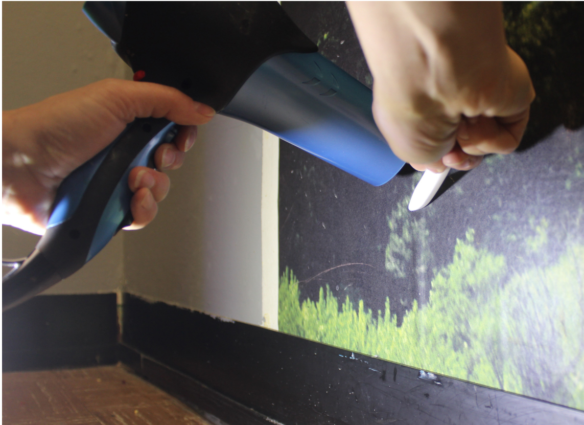
Fig. 10. Using heat from a hair dryer and Teflon folder to remove minor bubbling.

museum's regular maintenance plan and be repeated every few years.