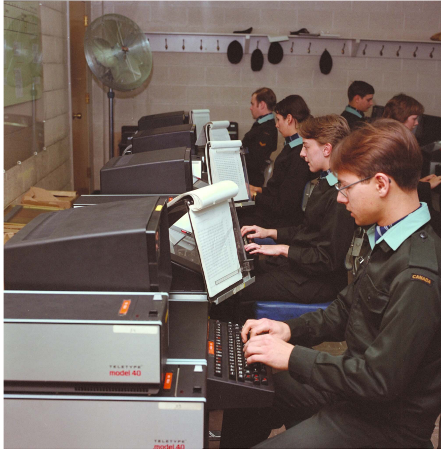
Fig. 3. Simulated exercise in the Emergency Government Situation Centre, ca. 1986.

was filtered into the bunker through a five-stage system that removed radioactive air particles while water was pumped from two deep wells. The country could be notified of ongoing public service information from a Canadian Broadcasting Corporation studio that broadcast from the site nationwide. For eating, the site had a sizable cafeteria that contained a regular supply of fresh food that would last for 10 days before switching to packaged rations. Soldiers and civilians could exercise at a fitness room in the hallway to the former Bank of Canada vault.