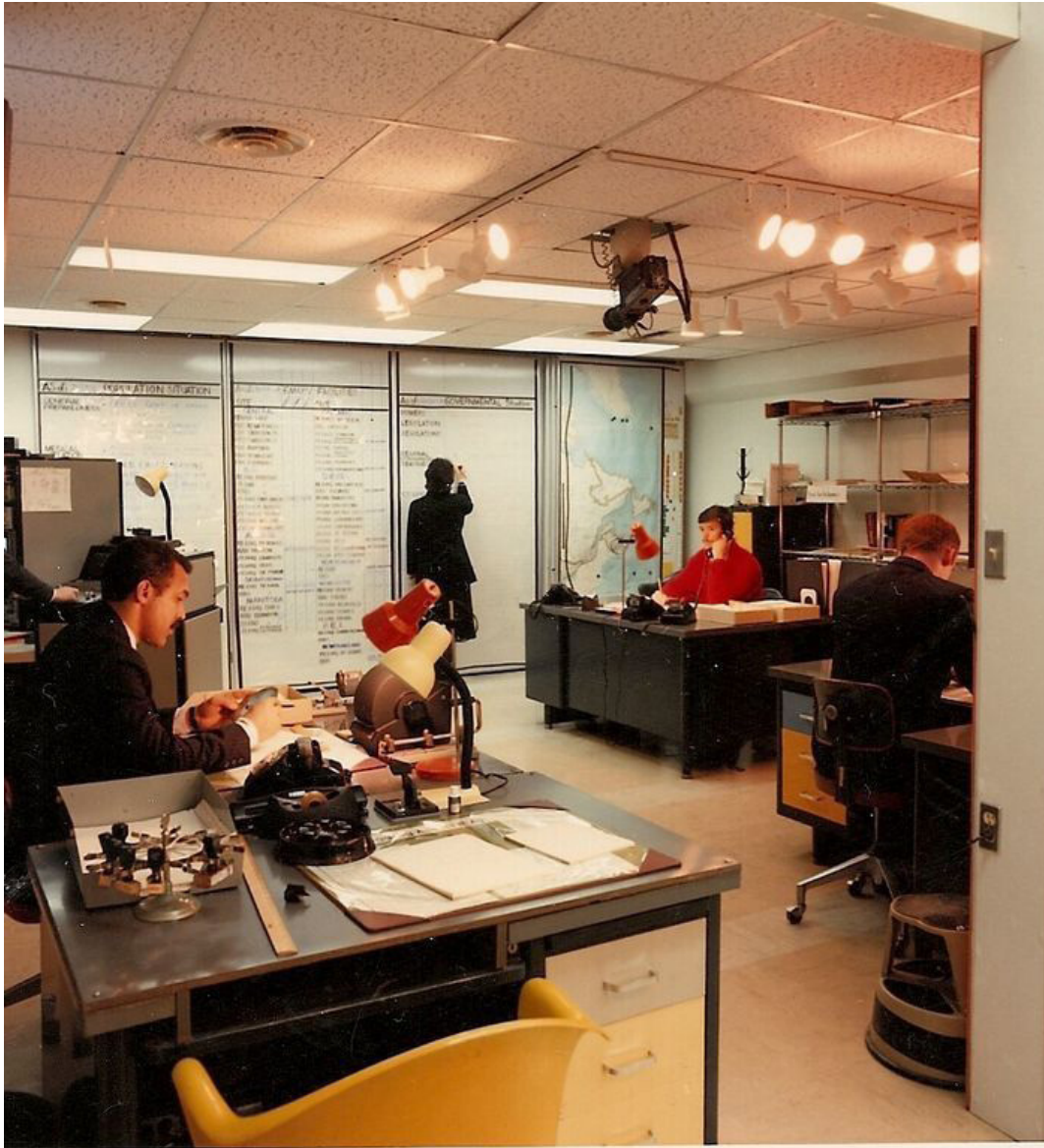
Fig. 2. Teletype operators at work in Canadian Forces Station Carp, ca. 1980. This is a staged photograph from inside the Bunker of military teletype operators who would write and relay messages through the Bunker to various military bases across the country.

won't admit that...This is the Diefenbunker." Even then, public speculations ran wild from joke suggestions that the site was where the government would bury tax dollars to the outlandish claim that the site would hoard the country's stockpile of bananas, to be sold at an exorbitant price once the country returned to normal.