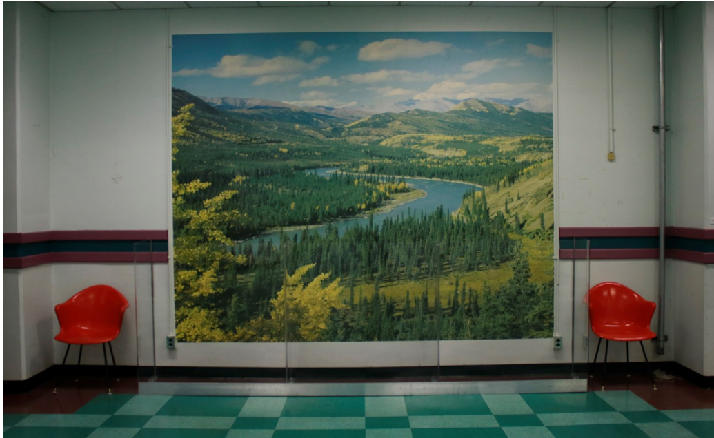
Fig. 14. Barrier solution.