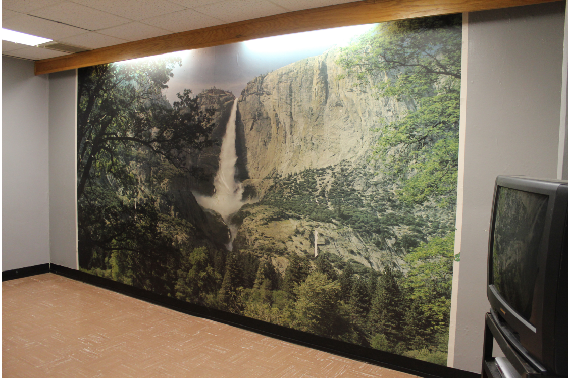
Fig. 5. Yosemite mural in the programming room.