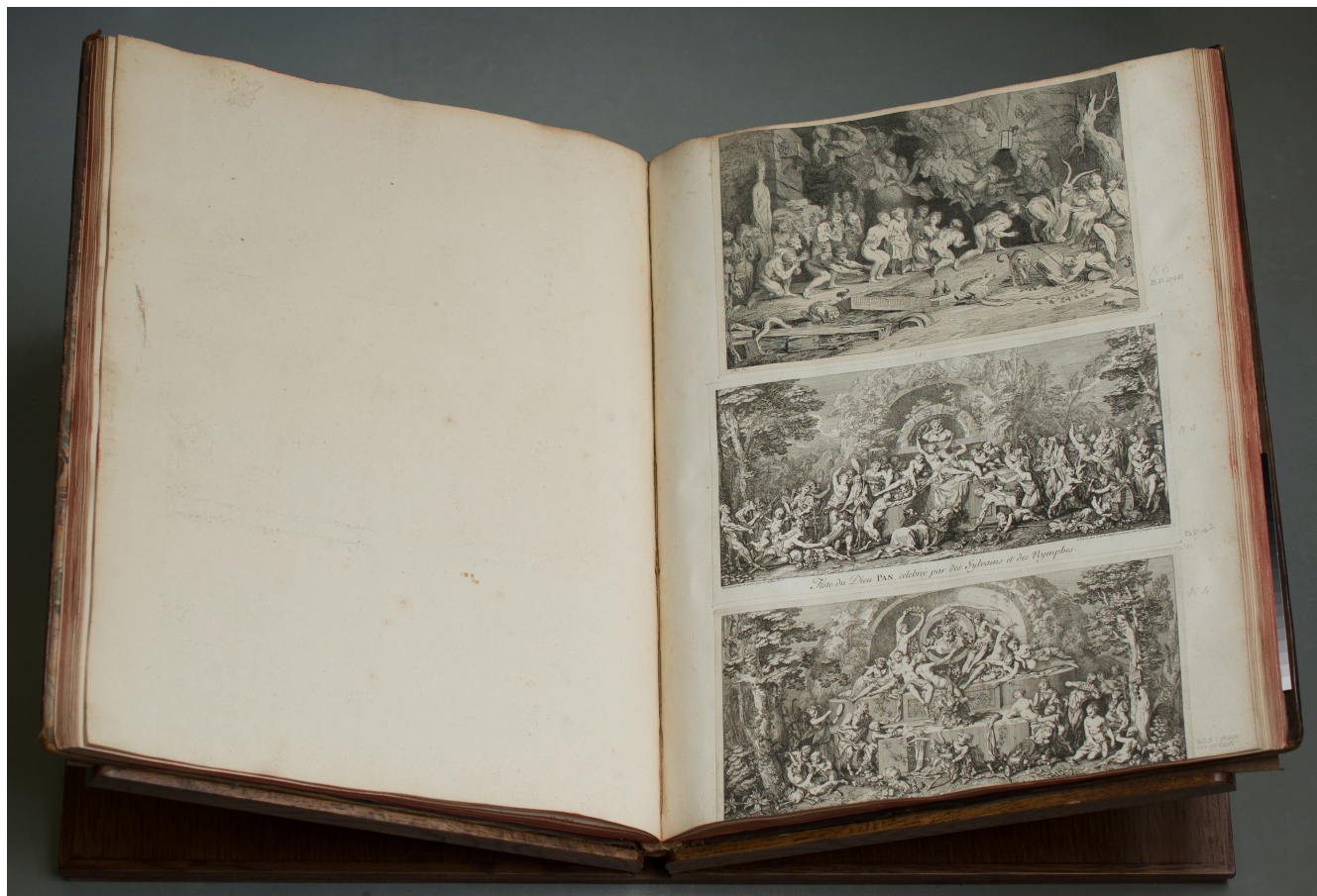
Fig. 4. Engravings by Claude Gillot album containing 384 etchings and engravings by and after Claude Gillot. 24.K.12-180-182.

the prints had been pasted. In some instances, this alteration chops off significant amounts of the prints within (fig. 4).