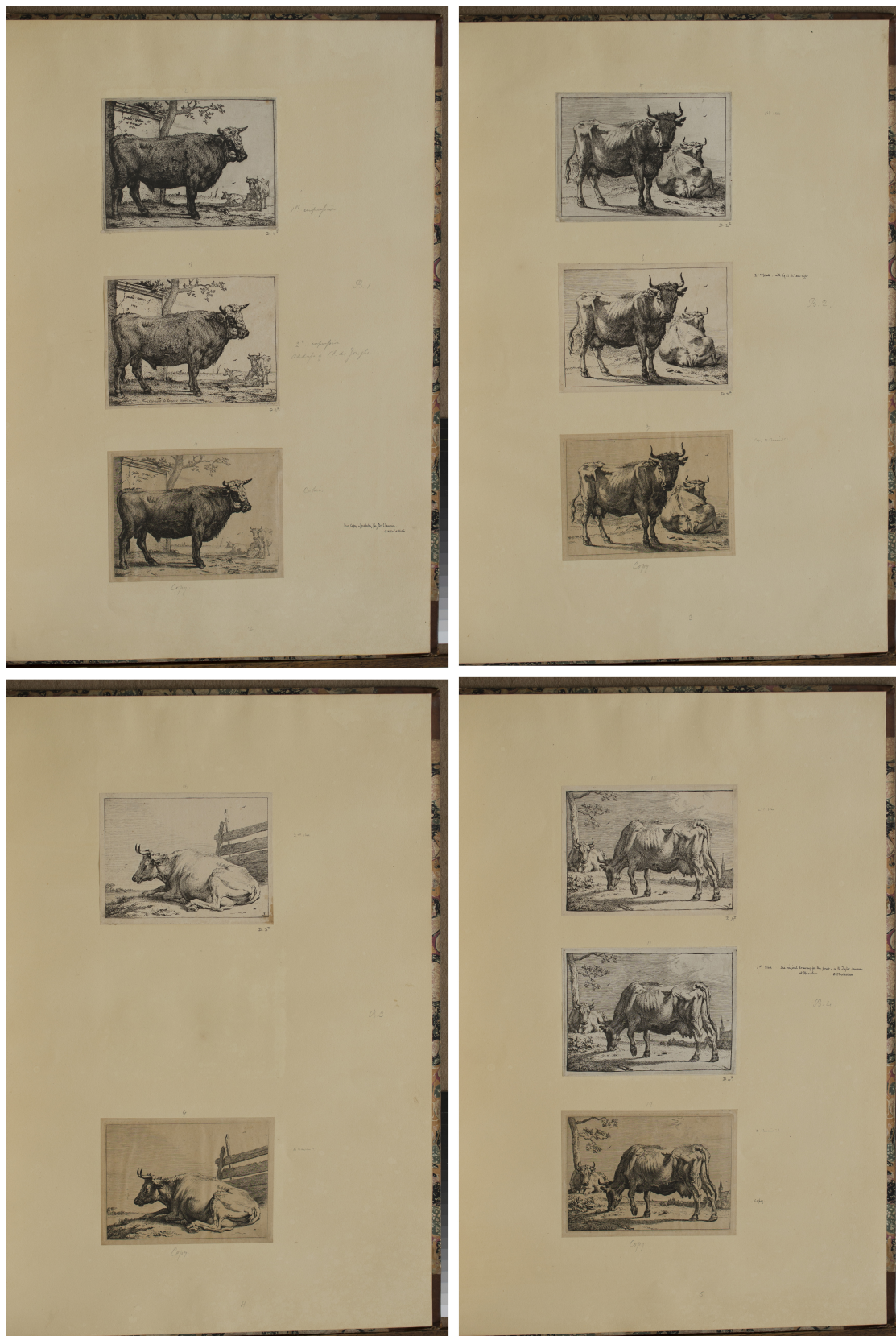
Fig. 7. Gravures de Paul Potter album containing 56 etchings by Paulus Potter. 30.I.6-2-12.