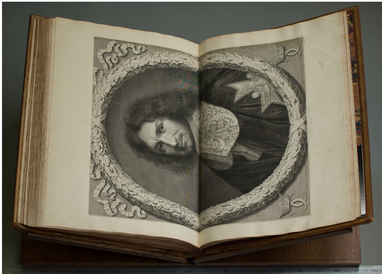
Fig. 6. Robert Nanteuil Portrait of Jean Baptiste Colbert , 1670, engraving, 640 × 545 mm. 23.K.8-344. Inlaid and attached on thrown-out guard.

well-known artists, as well as more unfashionable types of print sometimes called reproductive , by printmakers who translated the designs of other artists. Fitzwilliam treated all printmakers in the same way: he clearly wanted to represent all schools.