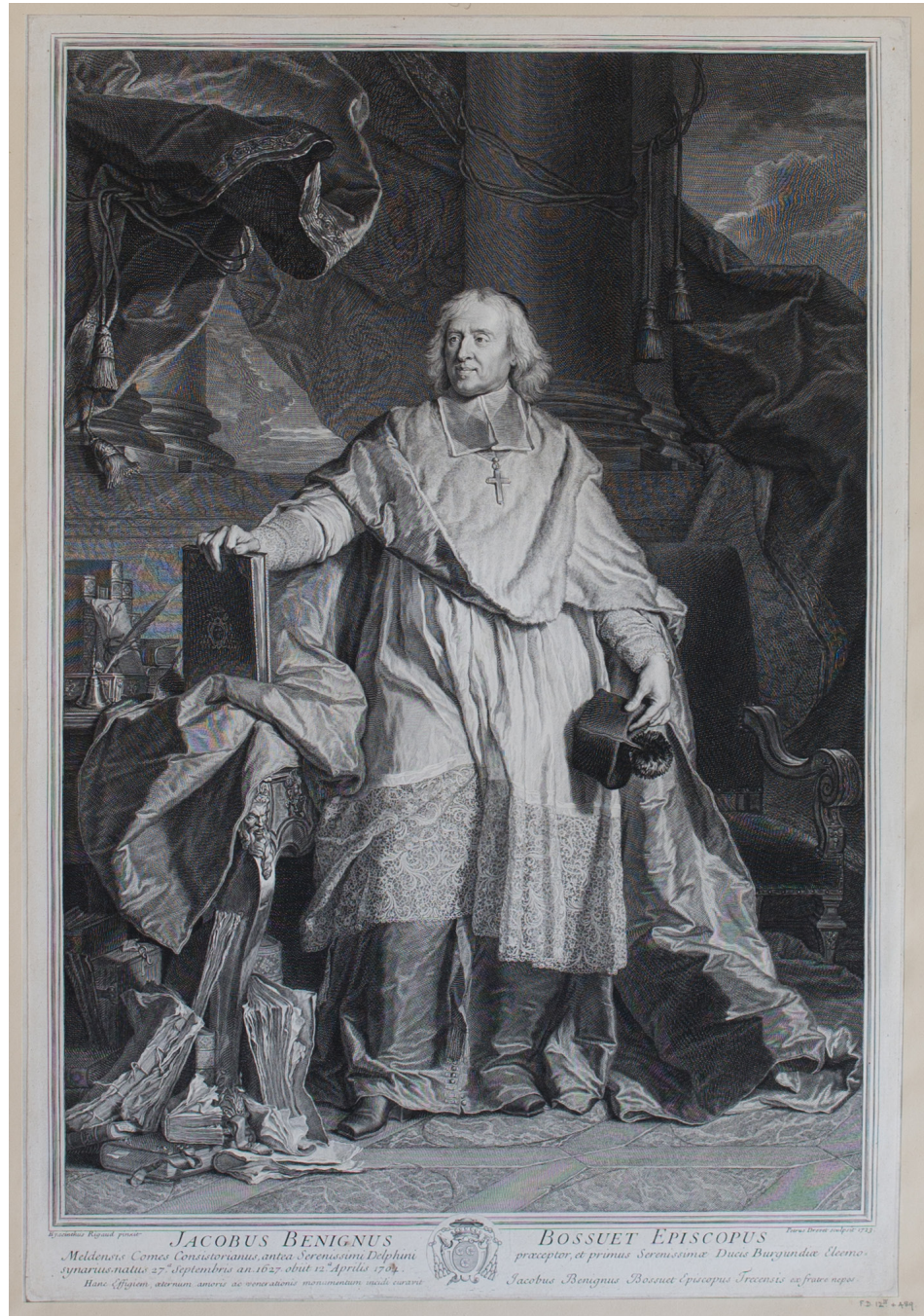
Fig. 3. Pierre-Imbert Drevet after Hyacinthe Rigaud, Portrait of Bishop Jacques-Benigne Bossuet , 1723, engraving, 511 × 351 mm, 34.A.1-33.

inscription is written underneath an inlaid print, that it refers to the pasted-down print on the previous page, showing that Fitzwilliam did indeed receive an impression (De Boissieu, n.d., 30.K.7).