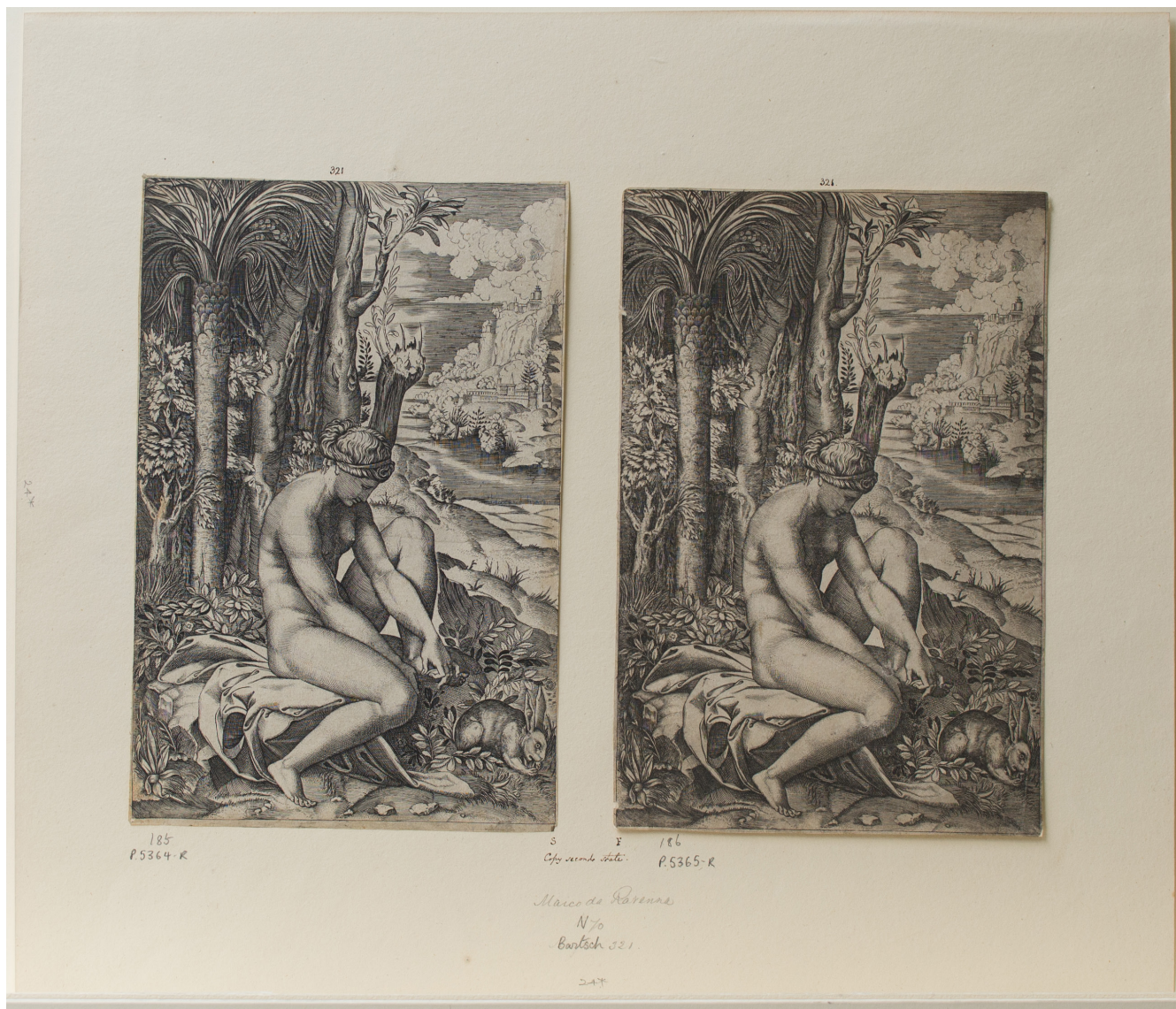
Fig. 8. Marco Dente after Raphael, Venus Wounded by a Rose's Thorn , 1515, engraving, 267 × 174 mm, P5364-R & P5365-R.

numbers are lost. We do not know the numbers of around 60 of the 370 mezzotints.