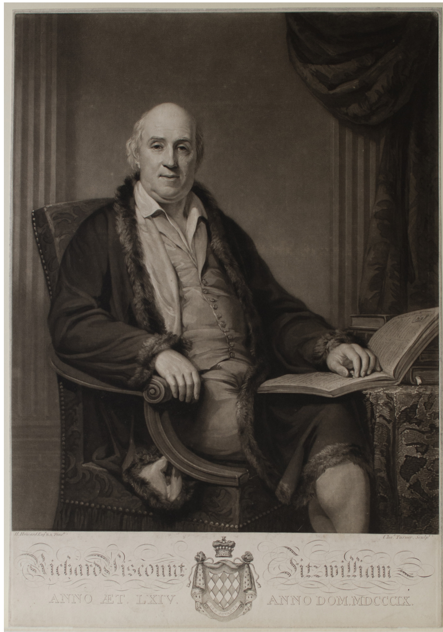
Fig. 1. Charles Turner after Henry Howard, Richard, 7th Viscount Fitzwilliam of Merrion , 1809, mezzotint, plate size 453 × 313 mm, 33.A.temp.28.

[W]ith many thanks for your offer of service, will beg of you to bring back with you the well known engraving of Bossuet. I forget by whom and perhaps mistaken in saying that it is from