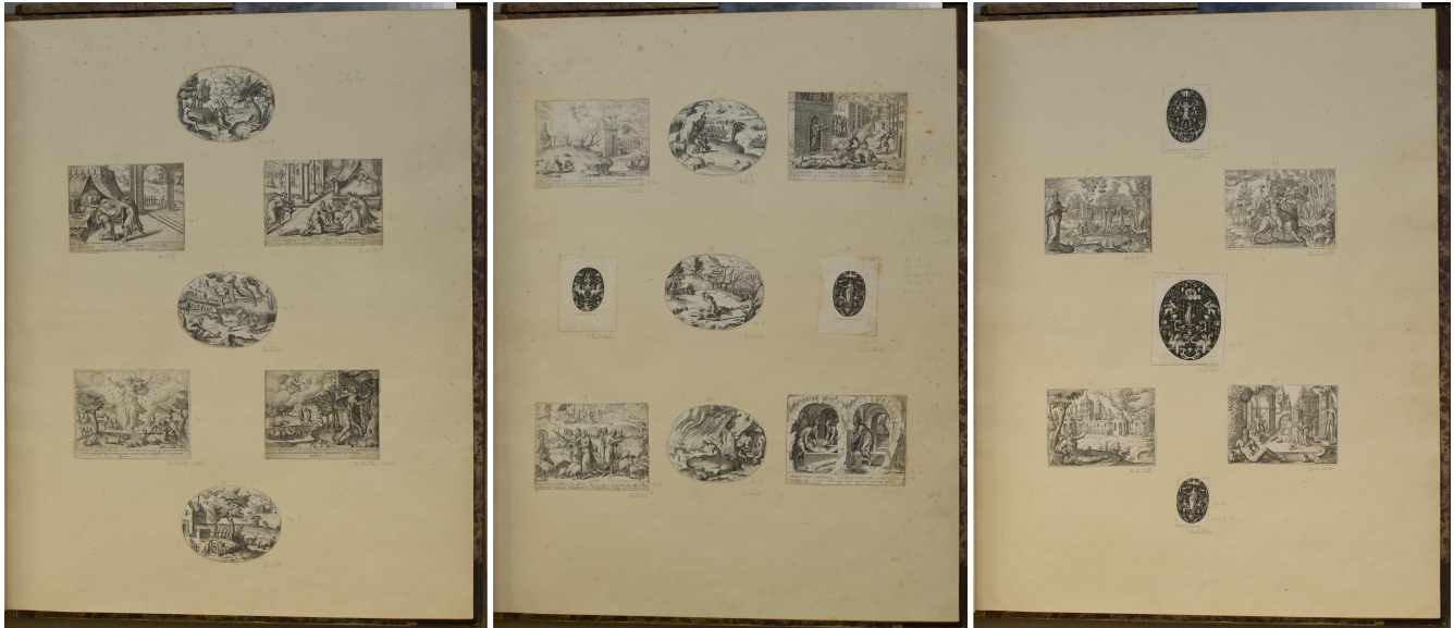
Fig. 5. Engravings by Etienne De l'Aulne album containing 169 engravings by Étienne Delaune. 22.I.11-6-28.

Potter (1625–1654) album, is written in a combination of English and French. In translation it reads, “Engravings by / Paul Potter / Complete / hot pressed / Portrait wanting, in half-Russia, yellow-tinted pages, three blank sheets added at the front and at the back, and the word ‘Potter’ for the spine” (Potter, n.d., 30.I.6).