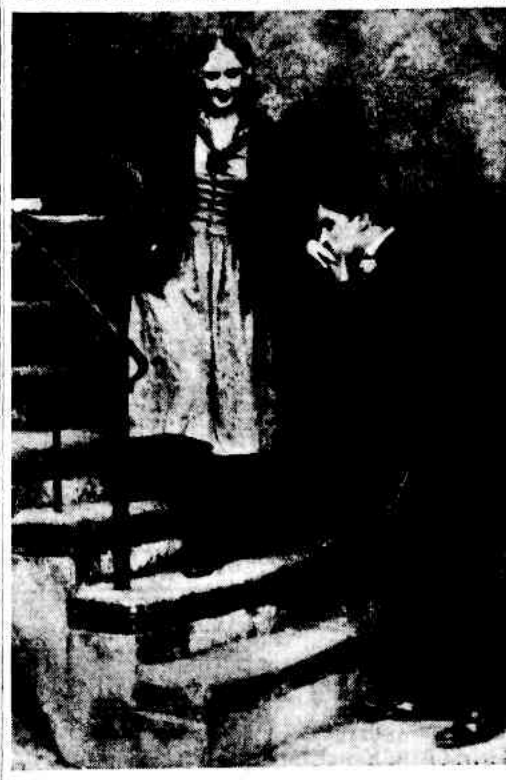
Virginia Cherrill, one of Chaplin's "discoveries," plays the blind girl whom he befriends in "City Lights."