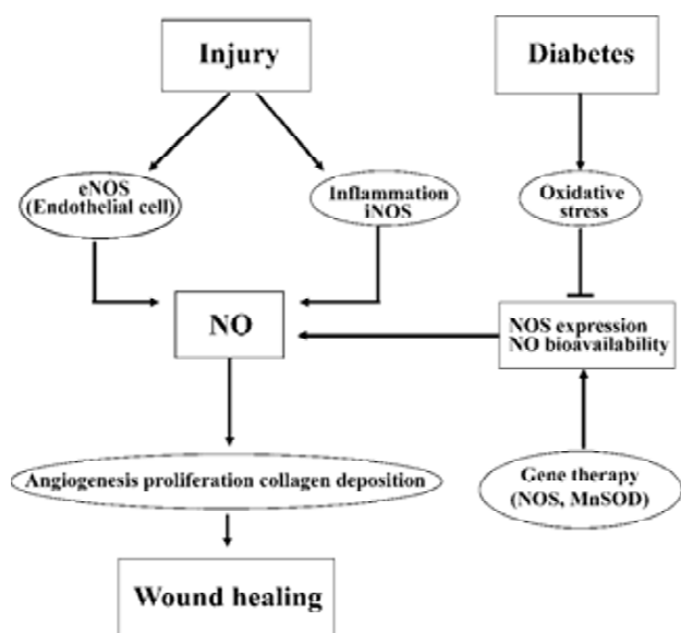
Figure 1. Nitric oxide (NO) as a signaling molecule accelerates wound healing. Abbreviations: eNOS, endothelial nitric oxide synthase; iNOS, inducible nitric oxide synthase; MnSOD, manganese superoxide dismutase; VEGF, vascular endothelium growth factor.

wound repair. NO plays a central role in this process [24] as it increases angiogenesis in ischemic murine tissues [25] . Conversely, NOS inhibitors impair angiogenesis in granulation tissue during gastric ulcer healing [26] and suppress capillary organization in vitro [27] .