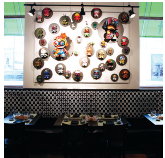
Japanese Munny dolls at Masu Sushi & Robata