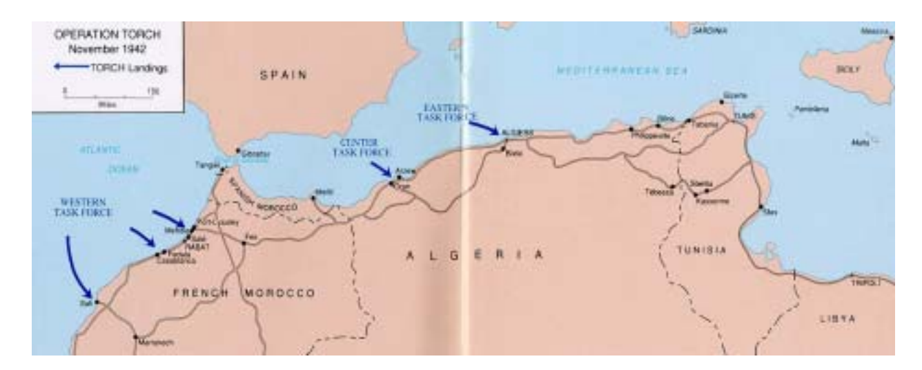
Figure 1 Allied Landing Sites for Operation Torch