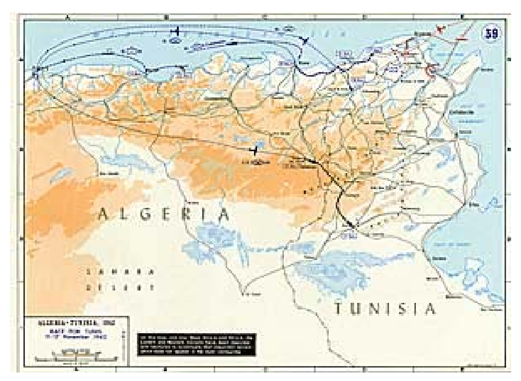
Figure 2 The Push into Tunisia

As the operation began, the Americans and British hoped the French would not resist the Allied landings, and further expected French forces in North Africa would rejoin the anti-Axis alliance. In order to facilitate these hopes, the Allies designated General Dwight D. Eisenhower to command the invasion forces. With an American general leading the forces, the Allies sought to restrict any resistance from Anglophobic French officials and officers in the areas around the invasion beaches and ports. <sup>9</sup> Despite such measures, however, the French did put up some level of resistance at nearly every landing point. Nonetheless, dissension among the various French factions in North Africa limited the cohesiveness and effectiveness of the opposition. Ultimately, the magnitude and rapidity of the Allied invasion narrowly ensured the success of the invasion, though much was still required to bring together the warring French factions.<sup>10</sup>