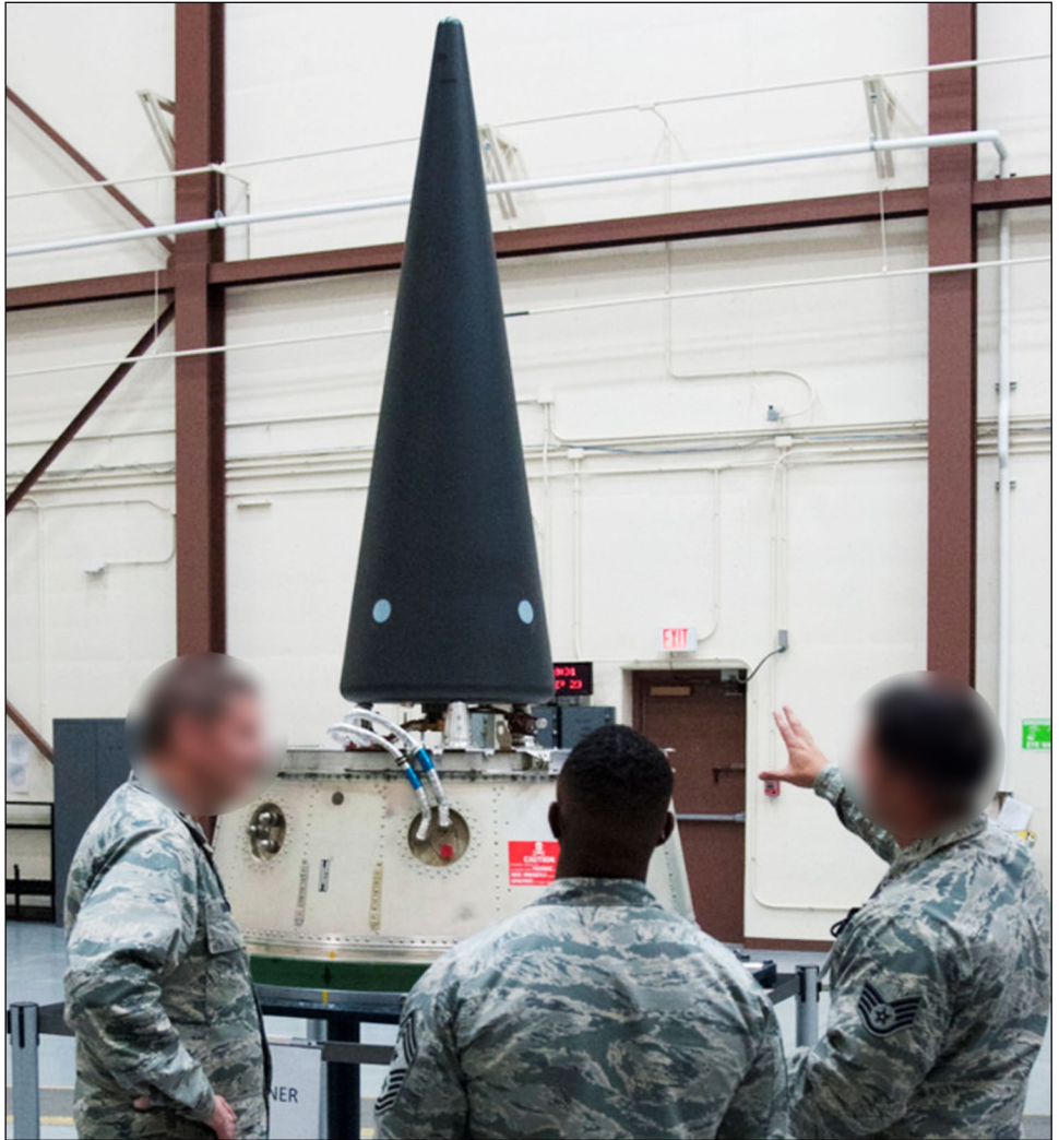
Figure 1: W87-0 Nuclear Warhead within a Mk21 Reentry Vehicle

GAO-20-703