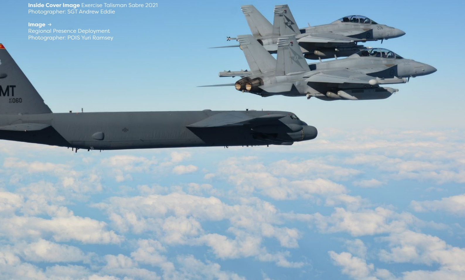
Image → Regional Presence Deployment

Inside Cover Image Exercise Talisman Sabre 2021 Photographer: SGT Andrew Eddie