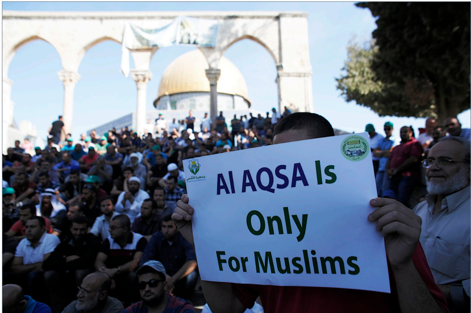
Palestinians demonstrate in front of the Dome of the Rock after clashes between Palestinian stone throwers and Israeli forces on the Temple Mount on September 27, 2015.