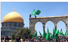
Hamas flags on the Temple Mount