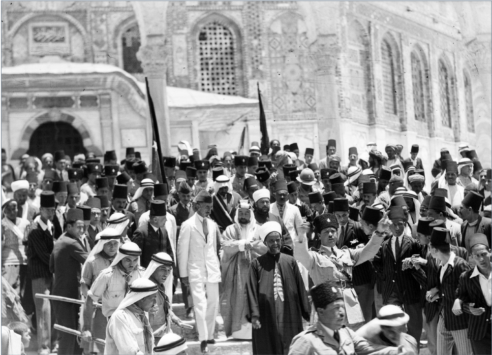
King Abdullah I of Jordan (at right in white kaffiya) and his brother King Feisal of Iraq (in white suit) at the al-Aqsa mosque and Dome of the Rock in Jerusalem, Palestine, circa 1933 68