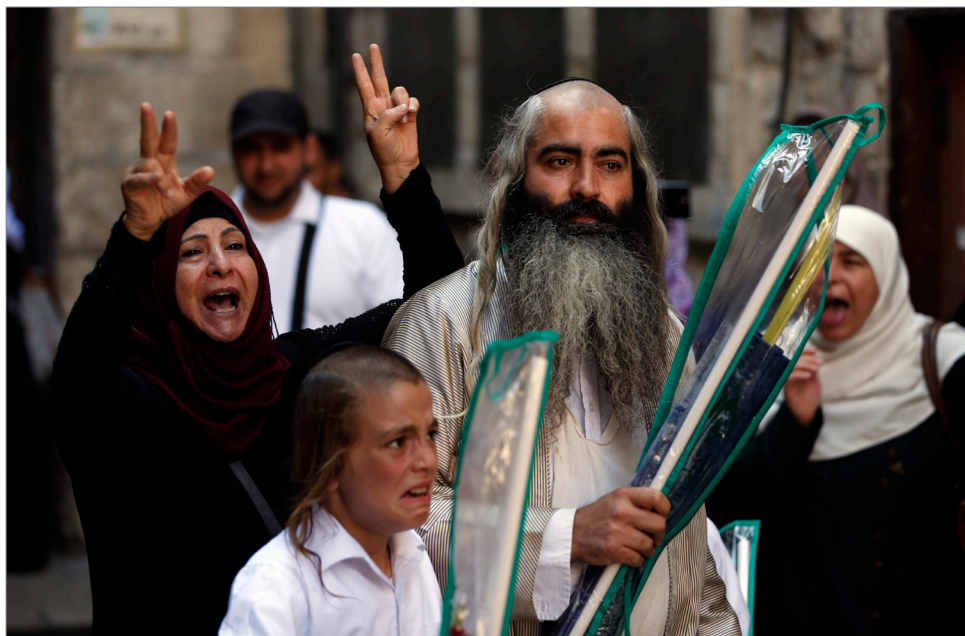
A Jewish boy cries as he and his father walk past Palestinian murabitat protesters.

This is the backdrop to this study, which briefly surveys the history of the status quo on the Temple Mount, presents the reasons for its establishment, details the many substantive changes it has undergone, and explains the reasons behind these changes. The questions at the heart of this study are: “Does the status quo still exist?” What form does it take? And, to what extent is it still relevant today?