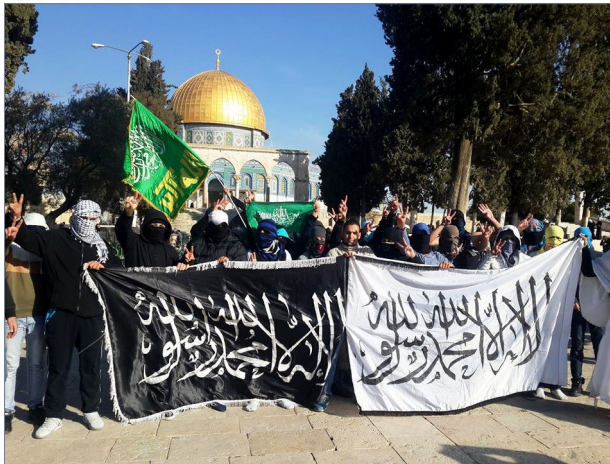
Murabitoun demonstrators on the Temple Mount

Israeli police, accustomed for years to having only a small minority of Jews wanting to visit the Temple Mount, were not prepared for this change. Time and again crowds waited in long and unnecessary lines, and harsh verbal exchanges ensued between those waiting to go up on the Temple Mount and the police on duty. There were instances where police prevented Jews from going up to the Mount. The increase in the number of Jews seeking to ascend to the Mount undoubtedly contributed to subjective Muslim perceptions that the status quo stood to be changed and the Mount stood to be lost and “conquered.” In fact, Israel did not allow these changes in halakhic rulings to change the human landscape on the Mount. The number of Jews who annually sought to go up on the Mount did not exceed 15,000, while each year hundreds of thousands of Muslims visited there. 81