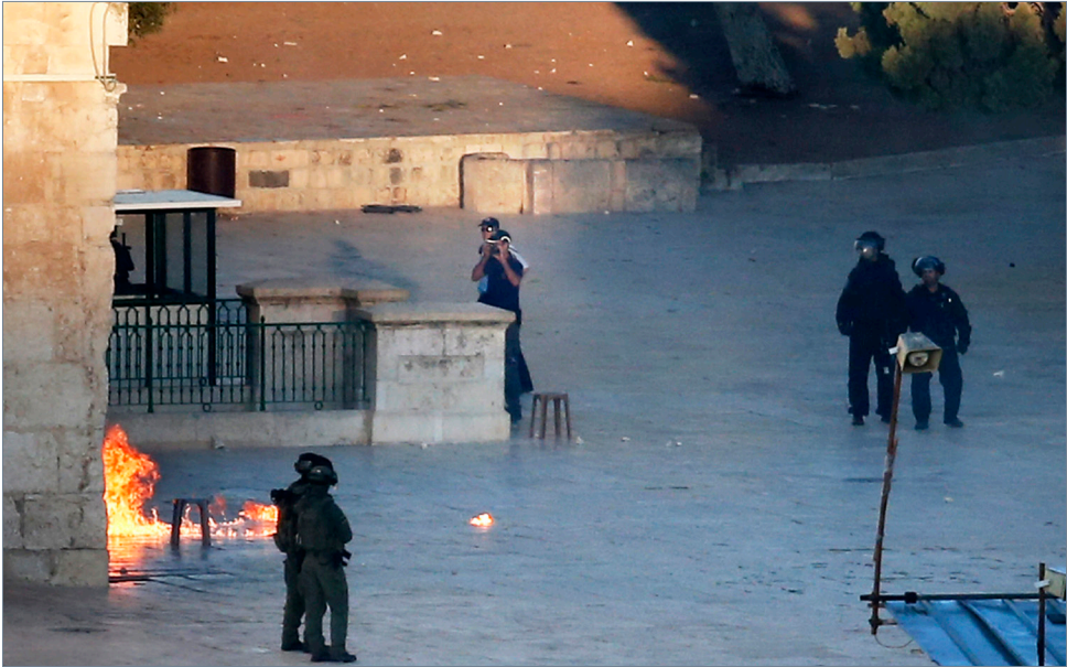
Israeli security forces stand guard at one of the main entrances of the al-Aqsa mosque as Palestinians throw firebombs from inside the mosque.

The severe incidents on the Temple Mount were accompanied by extreme incitement in which the Palestinian Authority played a core role. 18 During these months, incidents of violence and incitement against Jews on the Temple Mount escalated into severe riots. The pronouncements of the head of the Palestinian Authority, Mahmoud Abbas, that Jews defiled al-Aqsa and that their entrance to the Temple Mount should be prevented at all costs, added more fuel to the fire. 19 In the course of three days, Palestinian state television broadcasted Abbas' words of incitement 19 times. 20