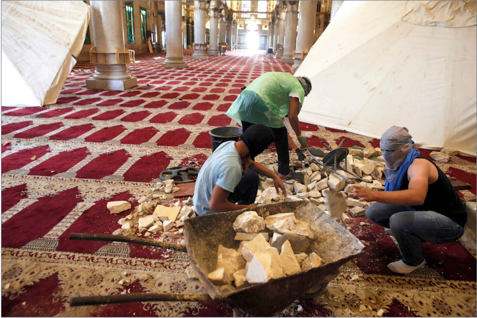
Masked Palestinians prepare stones inside Jerusalem’s al-Aqsa Mosque, one of Islam’s holiest sites, on September 27, 2015.

clashes on the Temple Mount, Jordan announced that it was recalling its ambassador to Israel for consultations and was even re-examining its 1994 peace treaty with Israel against the backdrop of what Jordan labeled “Israel’s aggression in the holy places to Islam in Jerusalem.”