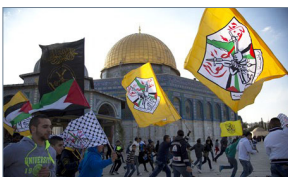
Fatah flags on the Temple Mount

Today, the prohibition against raising flags on the Temple Mount is enforced only when the flag in question is an Israeli flag. By contrast, flags are frequently raised – Islamic movement flags and even the flags of terrorist movements such as Hamas – in the course of demonstrations and rallies that take place on the Mount. In this case as well, the Israeli police prefer to exercise restraint, their main concern being to avoid clashes with demonstrators within the Temple Mount compound and risk the deterioration of the situation. 69