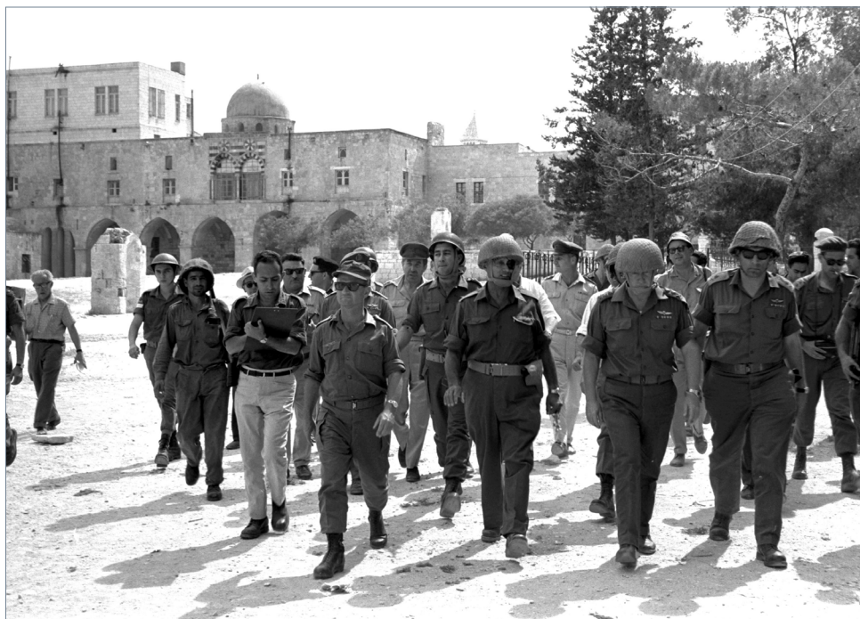
Defense Minister Moshe Dayan (center) visits the Temple Mount after its capture, June 7, 1967. Accompanying him (from right to left) Gen. Rehavam Zeevi, Chief of Staff Yitzhak Rabin, Dayan, and Gen. Uzi Narkis. Future president Chaim Herzog is in the third row, center.

Within hours of Israel's victory in Six-Day War and the unification of Jerusalem, the Minister of Defense at the time, Moshe Dayan, arrived on the Temple Mount and began to formulate the arrangements that would eventually be labeled "the status quo on the Temple Mount." 30 Dayan ordered the Israeli flag that had been raised at the site to be lowered and Israeli forces on the Temple Mount to be withdrawn to a position in the northern sector of the compound. In the days that followed, Dayan acted alone (without any decision by the Cabinet), consulting with only a few experts.