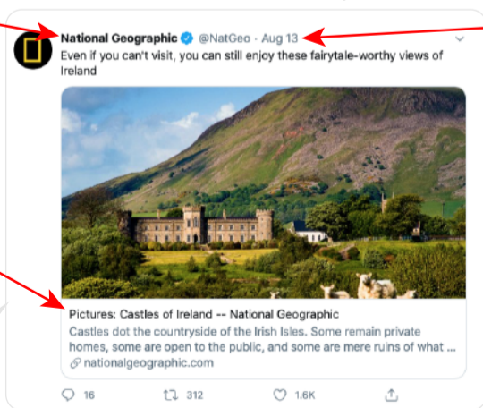
Photo title or description