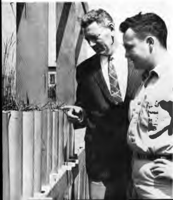
Range Management student observes grass rooting-depth studies.