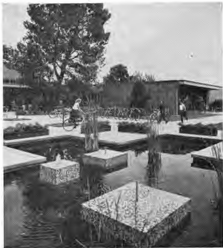
Memorial Union Court