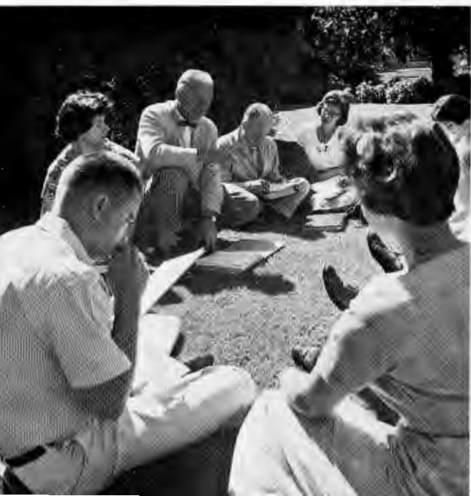
An education class moves outdoors on a fine spring day.