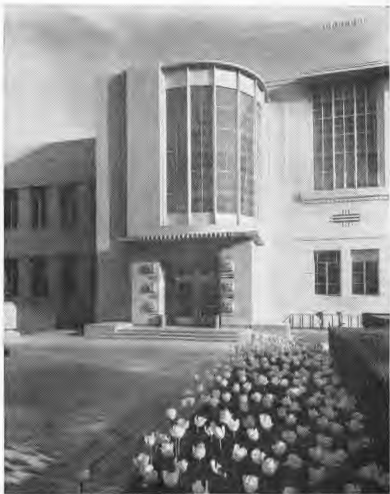
Entrance to administrative section of Library-Administration Building