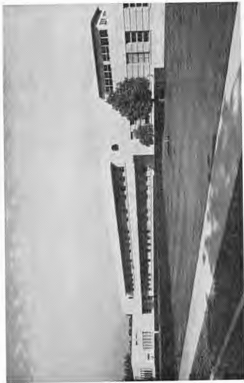
The Chemistry Building