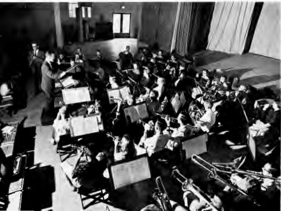
The University Band rehearses.

The fine arts are playing an increasing role at Davis.