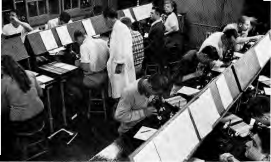
A zology laboratory session.