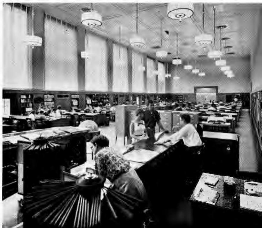
The reference reading room of the Davis library.