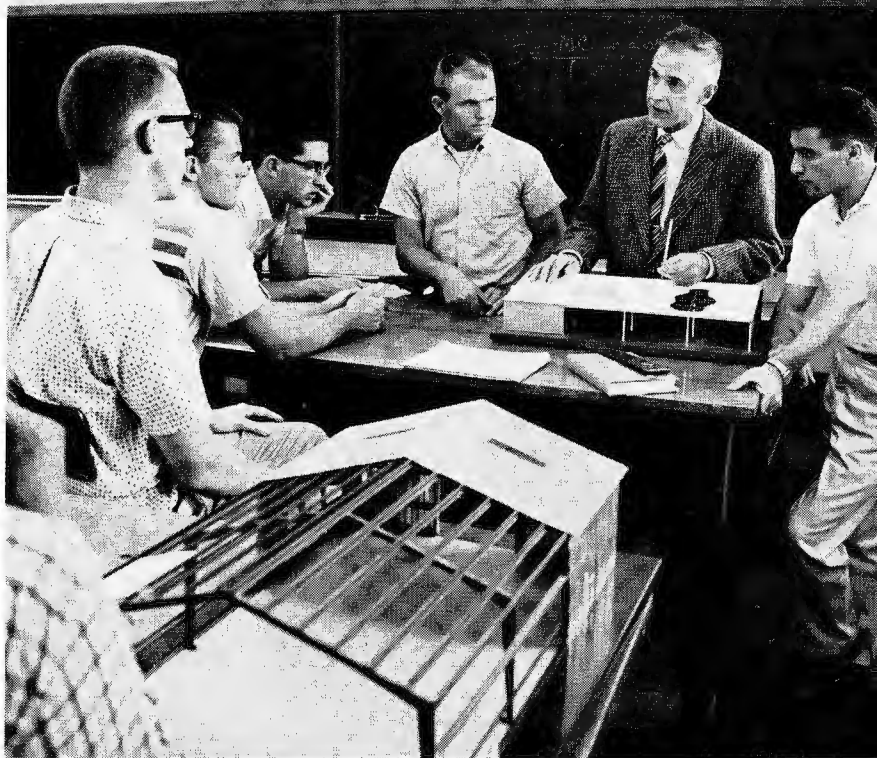
An engineering class discusses models of farm structures.