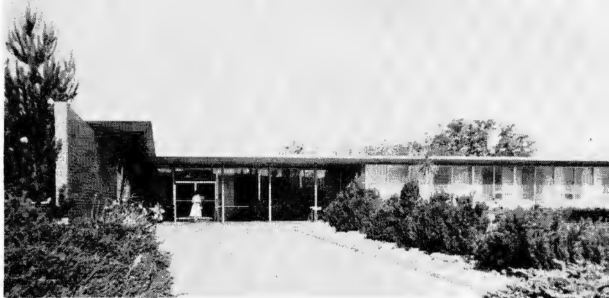
The Student Health Center, situated near the residence hall area.