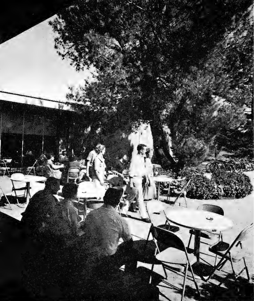
The Memorial Union patio, center of Davis student life.