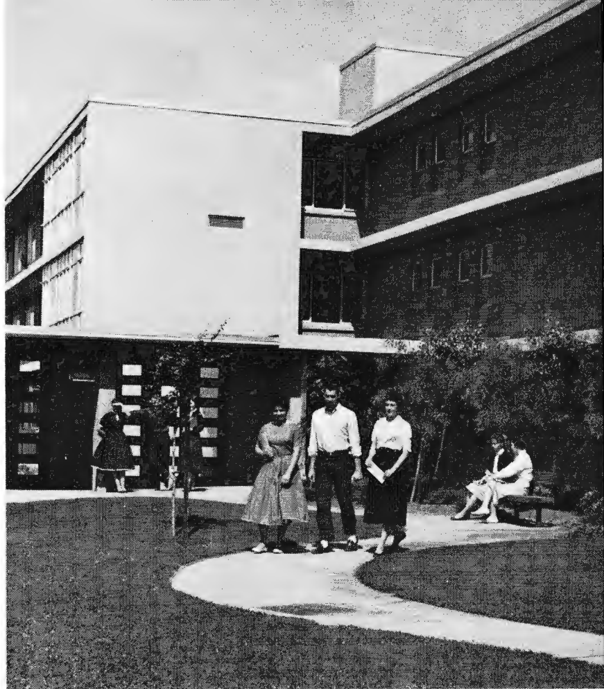
Patio of one of the new women's residence halls, Struve Hall.