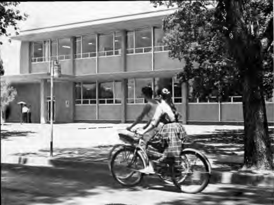
Robbins Hall, new home of the Botany and Entomology departments. At the entrance is the Freeborn Ash, planted on Arbor Day, 1960.