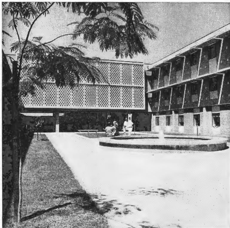
Academic Office Building

For information regarding any of these services, contact University Extension on any of the following University campuses: Davis, Berkeley, Los Angeles, Riverside, or Santa Barbara.