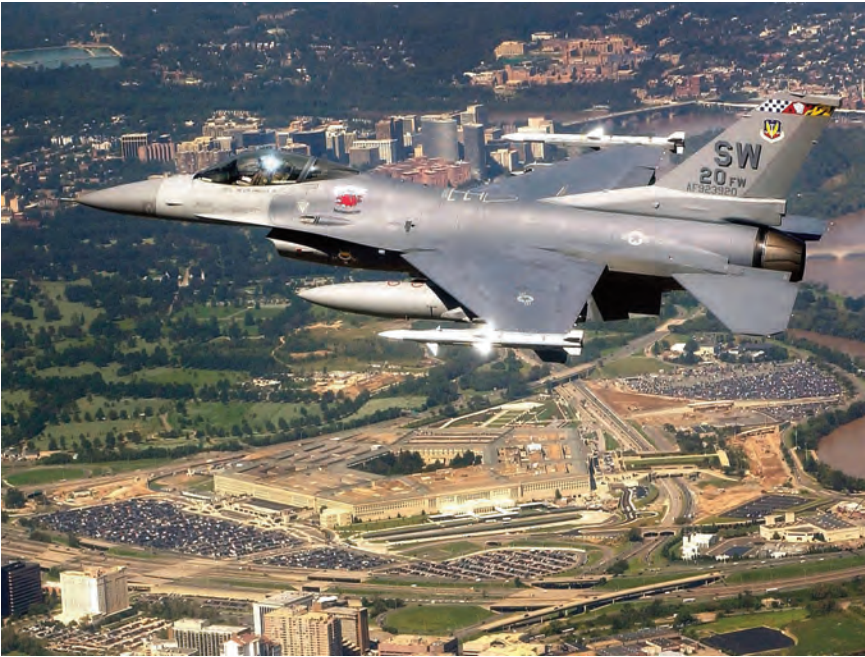
An F-16 Fighting Falcon flying over the Pentagon as part of Operation Noble Eagle, September 24, 2003. The aircraft is assigned to the 20th Fighter Wing at Shaw Air Force Base, South Carolina.