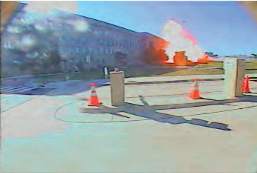
An image of the crash of American Airlines Flight 77 into the Pentagon, captured by a facility security camera.