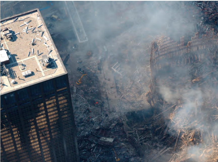
Rubble at Ground Zero, September 19, 2001, one week after al Qaeda terrorists flew American Airlines Flight 11 and United Airlines Flight 175 into the World Trade Center towers, causing their collapse.