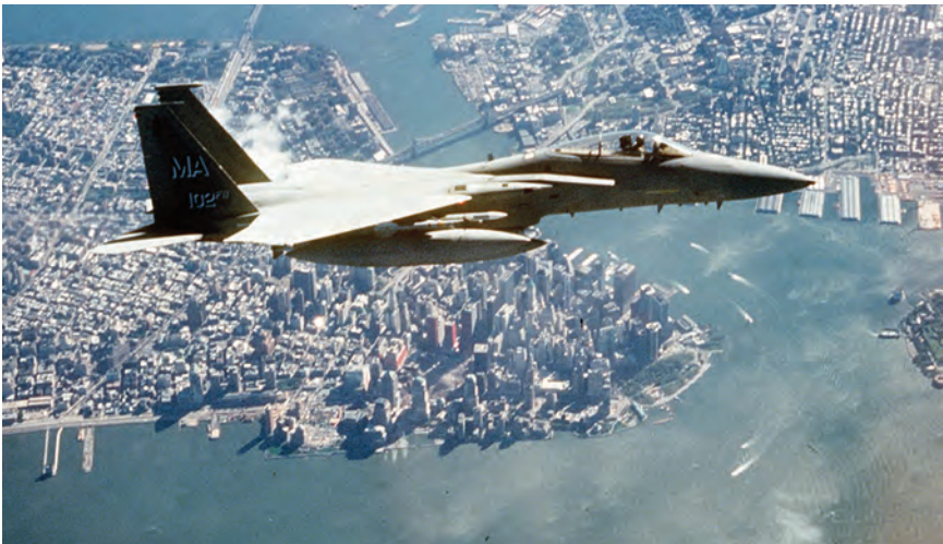
An F-15 of the 102d Fighter Wing, Massachusetts Air National Guard, flying over lower Manhattan and Ground Zero during an Operation Noble Eagle combat air patrol mission several months after the 9/11 attacks.