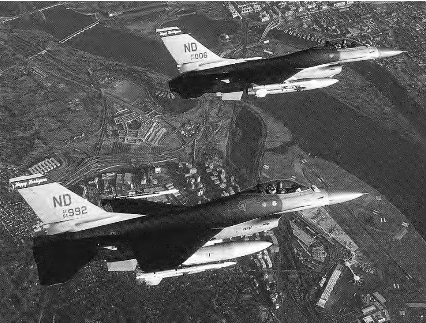
F-16s of the 119th Fighter Wing, North Dakota Air National Guard, flying a combat air patrol over the Pentagon and Washington, D.C., as part of Operation Noble Eagle, November 2001.