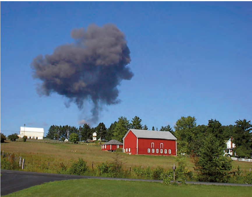
A gray smoke plume rising above the crash site of United Airlines Flight 93 near Shanksville, Pennsylvania.