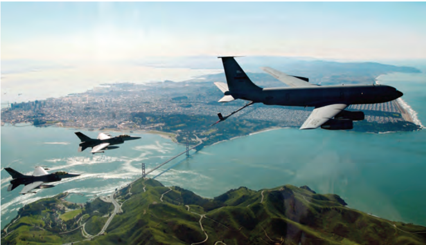
Two F-16 Fighting Falcons flying over San Francisco Bay and into precontact position with a KC-135E Stratotanker before refueling during an Operation Noble Eagle training patrol, March 16, 2004. The F-16s are with the California Air National Guard's 144th Fighter Wing in Fresno. The KC-135 is with the 940th Aerial Refueling Wing at Beale Air Force Base, California.