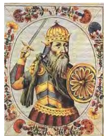
Sviatoslav I in the Tsarsky Titulyarnik , 1672