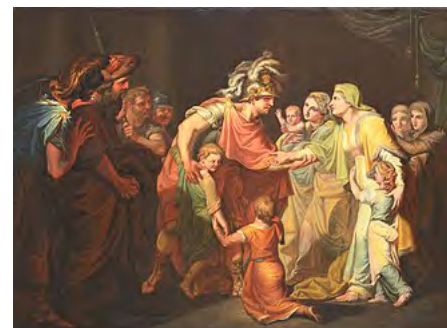
Ivan Akimov . Sviatoslav's Return from the Danube to His Family in Kiev (1773)

Знаменитый сок Дуная, Наливая в глубь главы, Стану пить я, вспоминая Светлых клич: "Иду на вы!".