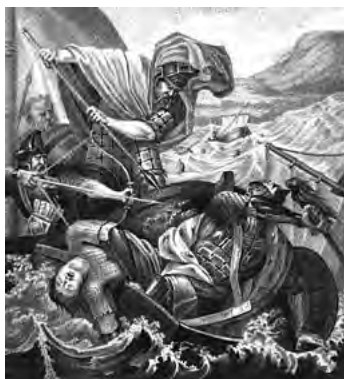
The Death of Sviatoslav by Boris Chorikov

Fearing that the peace with Sviatoslav would not endure, the Byzantine emperor induced the Pecheneg khan Kurya to kill Sviatoslav before he reached Kiev. This was in line with the policy outlined by Constantine VII Porphyrogenitus in De Administrando Imperio of fomenting strife between the Rus' and the Pechenegs. [45] According to the Slavic chronicle, Sveneld attempted to warn Sviatoslav to avoid the Dnieper rapids, but the prince slighted his wise advice and was ambushed and slain by the Pechenegs when he tried to cross the cataracts near Khortytsia early in 972. The Primary Chronicle reports that his skull was made into a chalice by the Pecheneg khan. [46]