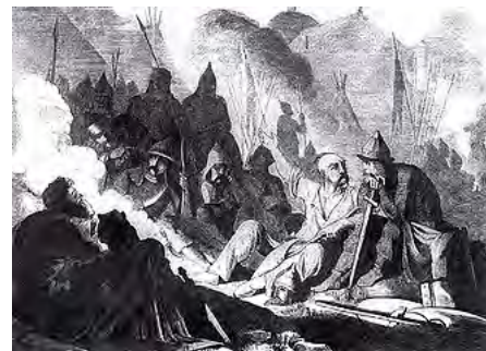
Sviatoslav's Council of War by Boris Chorikov

Although Ibn Haukal reports the sack of Samandar by Sviatoslav, the Rus' leader did not bother to occupy the Khazar heartlands north of the Caucasus Mountains permanently. On his way back to Kiev, Sviatoslav chose to strike against the Ossetians and force them into subservience. [32] Therefore, Khazar successor statelets continued their precarious existence in the region. [33] The destruction of Khazar imperial power paved the way for Kievan Rus' to dominate north–south trade routes through the steppe and across the Black Sea , routes that formerly had been a major source of revenue for the Khazars. Moreover, Sviatoslav's campaigns led to increased Slavic settlement in the region of the Saltovo-Mayaki culture, greatly changing the demographics and culture of the transitional area between the forest and the steppe. [34]