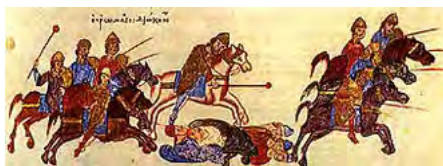
Pursuit of Sviatoslav's warriors by the Byzantine army, a miniature from 11th century chronicles of John Skylitzes .