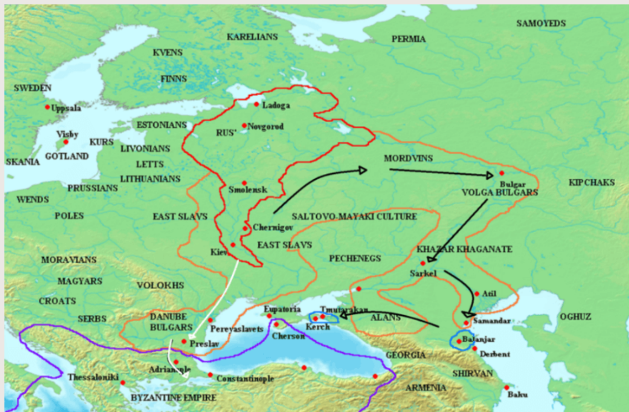
Red: The Kievan Rus' at the beginning of Sviatoslav's reign. Orange: Sviatoslav's growing kingdom in AD 972

His greatest success was the conquest of Khazaria , which for centuries had been one of the strongest states in the region. It is believed Sviatoslav had an interest in removing the Khazar hold on the Volga trade route because the Khazars collected duties from the goods transported via that river. Sviatoslav destroyed the Khazar city of Sarkel around AD 965, then subsequently sacked the Khazar capital of Atil. The destruction of Khazar imperial power paved the way for Kievan Rus' to dominate north-south trade routes through the steppe and across the Black Sea, routes that formerly had been a major source of revenue for the Khazars.