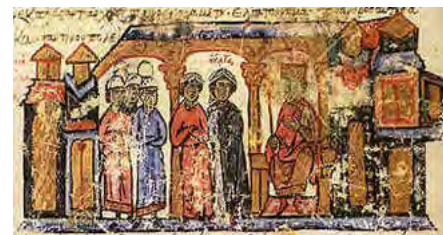
Sviatoslav's mother, Olga, with her escort in Constantinople, a miniature from the late 11th century chronicle of John Skylitzes .