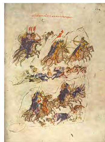
Sviatoslav invading Bulgaria, Manasses Chronicle

Sviatoslav defeated the Bulgarian ruler Boris II [40] and proceeded to occupy the whole of northern Bulgaria. Meanwhile, the Byzantines bribed the Pechenegs to attack and besiege Kiev, where Olga stayed with Sviatoslav's son Vladimir. The siege was relieved by the druzhina of Pretich , and immediately following the Pecheneg retreat, Olga sent a reproachful letter to Sviatoslav. He promptly returned and defeated the Pechenegs, who continued to threaten Kiev.