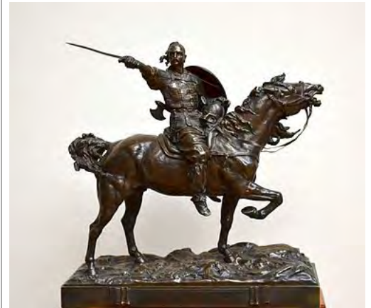
Sviatoslav I by Eugene Lanceray (1886)