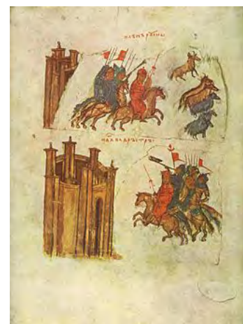
Siege of Durostorum in Manasses Chronicle

Sviatoslav retreated to Dorostolon , which the Byzantine armies besieged for sixty-five days. Cut off and surrounded, Sviatoslav came to terms with John and agreed to abandon the Balkans, renounce his claims to the southern Crimea, and return west of the Dnieper River . In return, the Byzantine emperor supplied the Rus' with food and safe passage home. Sviatoslav and his men set sail and landed on Berezan Island at the mouth of the Dnieper, where they made camp for the winter. Several months later, according to the Primary Chronicle , their camp was devastated by famine, so that even a horse's head could not be bought for less than a half-grivna. [44] While Sviatoslav's campaign brought no tangible results for the Rus', it weakened the Bulgarian state and left it vulnerable to the attacks of Basil the Bulgar-Slayer four decades later.