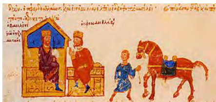
Madrid Skylitzes , meeting between John Tzimiskes and Sviatoslav.

Sviatoslav refused to turn his Balkan conquests over to the Byzantines, and the parties fell out as a result. To the chagrin of his boyars and his mother (who died within three days after learning about his decision), Sviatoslav decided to move his capital to Pereyaslavets in the mouth of the Danube due to the great potential of that location as a commercial hub. In the Primary Chronicle record for 969, Sviatoslav explains that it is to Pereyaslavets , the centre of his lands, "all the riches flow: gold, silks, wine, and various fruits from Greece , silver and horses from Hungary and Bohemia , and from Rus' furs, wax, honey, and slaves".