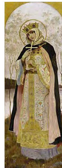
Olga of Kiev, who served as regent during her son's youth

Sviatoslav's appearance has been described very clearly by Leo the Deacon , who himself attended the meeting of Sviatoslav with John I Tzimiskes . Following Deacon's memories, Sviatoslav was a bright-eyed man of average height but of stalwart build, much more sturdy than Tzimiskes. He had a bald head and a wispy beard and wore a bushy mustache and a sidelock as a sign of his nobility. [15] He preferred to dress in white, and it was noted that his garments were much cleaner than those of his men, although he had a lot in common with his warriors. He wore a single large gold earring bearing a carbuncle and two pearls . [16]