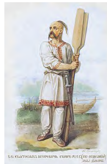
Illustration of Sviatoslav wearing a vyshyvanka , by Fedor Solntsev

Sviatoslav began by rallying the East Slavic vassal tribes of the Khazars to his cause. Those who would not join him, such as the Vyatichs , were attacked and forced to pay tribute to the Kievan Rus' rather than to the Khazars. [24] According to a legend recorded in the Primary Chronicle, Sviatoslav sent a message to the Vyatic rulers, consisting of a single phrase: "I want to come at you!" (Old East Slavic khochiu na vy iti ) [25] This phrase is used in modern Russian and Ukrainian (usually misquoted as idu na vy ) to denote an unequivocal declaration of one's intentions. Proceeding by the Oka and Volga rivers, he attacked Volga Bulgaria . He employed Oghuz and Pecheneg mercenaries in this campaign, perhaps to counter the superior cavalry of the Khazars and Bulgars. [26]