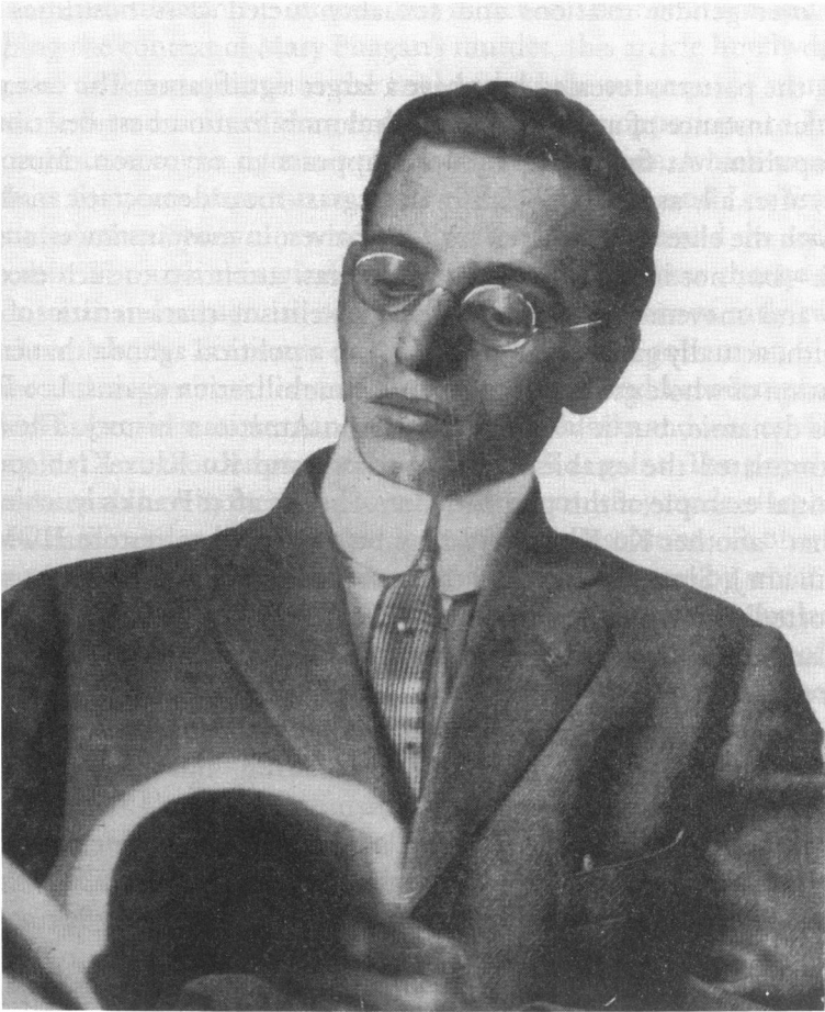
LEO FRANK. STUDY THE MOUTH, NOSE, AND AVERTED EYES

Photograph of Leo Frank, possibly retouched, that appeared in Watson's Magazine (March 1915).