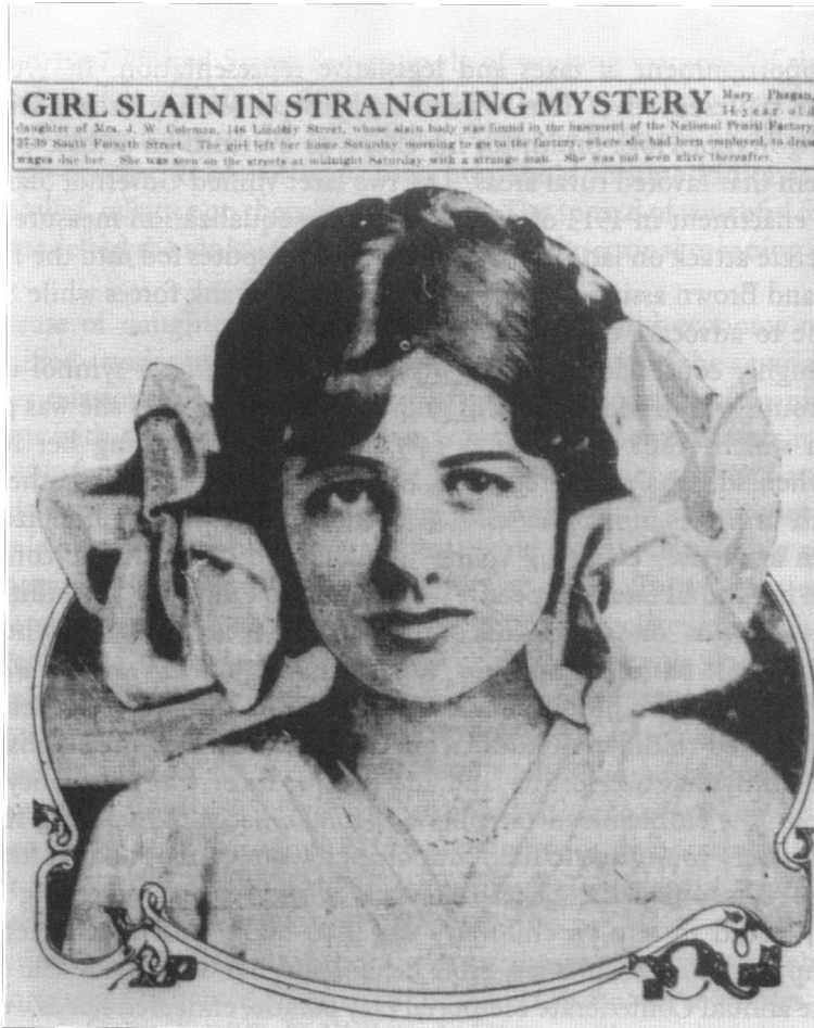
Mary Phagan, rendered as a Gibson girl in one of the first likenesses the public saw after her death. A contrast with the photo from which this picture was made makes the deliberate stylization clear (see facing page).

From Atlanta Georgian , April 28, 1913, p. 1.