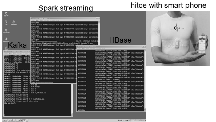
\boxtimes 2 Screen image of implemented platform

processing of vital data using Spark Streaming on a cloud. The second is stream processing of raw vital data on smart phones. This can reduce network cost to filter huge ECG data and can notify dangerous posture immediately. Our platform can manage workers' health information in realtime with low cost and enables real-time actions.