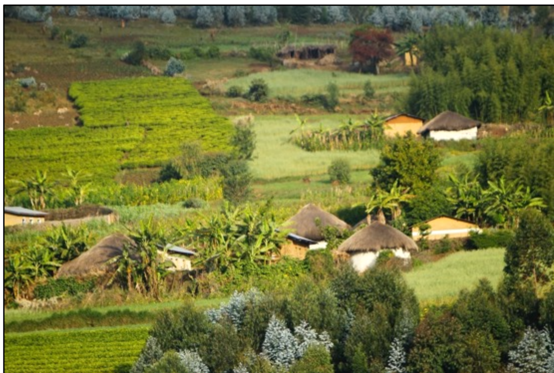
A landscape in Matana commune , Bururi province. Six CNL representatives were arrested following a meeting in their party office in Matana on 12 September 2020. They were released in late October.

CNL representatives in Bururi province have been particularly harassed. The party’s representatives of all six communes were arrested between 12 and 16 September, following a meeting in their premises in Matana on 12 September. 207 They were released in late October. Although these arrests were not officially linked to the armed attacks, they took place during a wave of arrests triggered by the incursions.