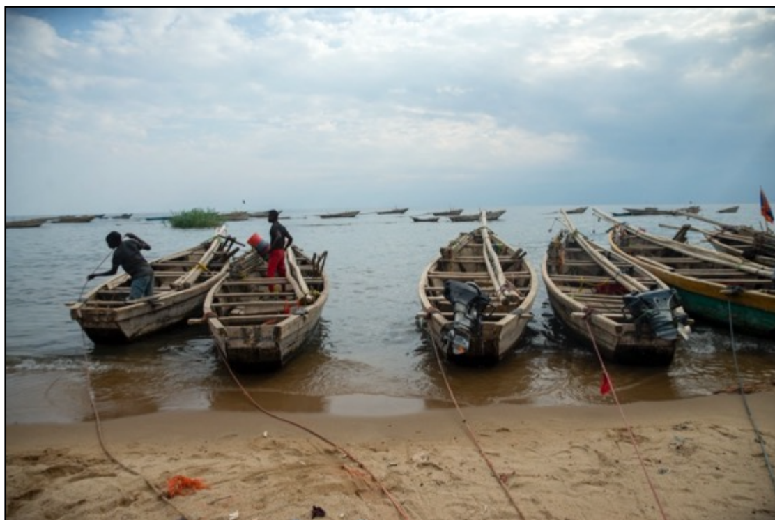
The port in Rumonge. In Burambi commune , Rumonge province, armed assailants have killed CNDD-FDD members and distributed tracts that warned Imbonerakure not to patrol at night.

Furious at the brazen attack on some of their own, Imbonerakure armed with machetes and sticks stopped a young man the next day, as he was on his way to attend the funeral of one of the victims. The Imbonerakure were heard asking him: “Did you come to make fun of us when you’re the perpetrator of this triple crime?” They cut the man’s legs with machetes, and only stopped assaulting him when a family member of one of the deceased intervened. The man sustained serious wounds on his legs. 165 It is not clear why the Imbonerakure targeted him.