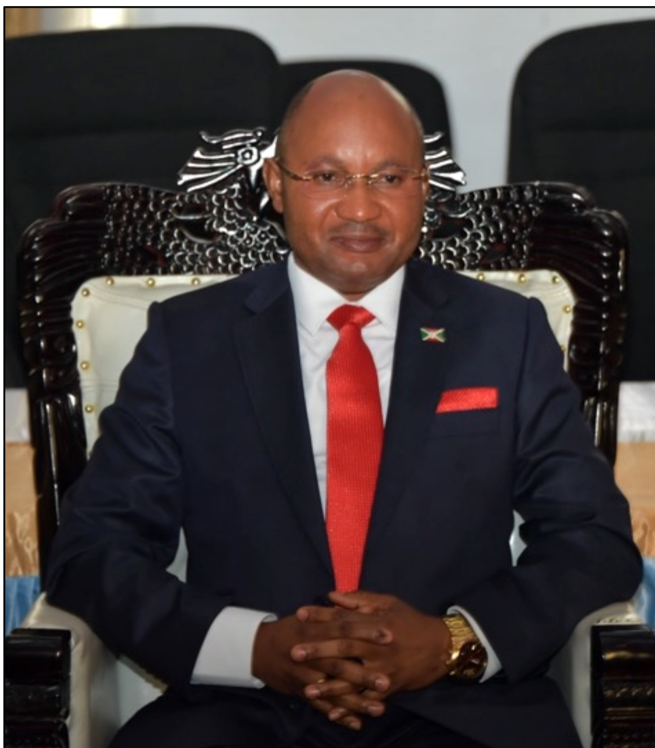
Prime Minister Alain Guillaume Bunyoni before his inauguration at the National Assembly in Bujumbura on 24 June 2020.

Bunyoni remained a close ally of President Nkurunziza until his death in June 2020, and was even described on the government website as a “hardliner” of the Nkurunziza regime; in late November, the page was removed. However, the relationship between the two men was, at times, reportedly strained.