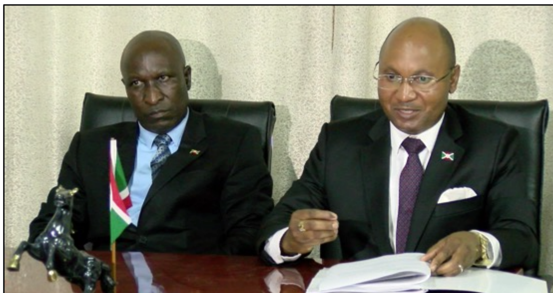
Gervais Ndirakobuca, minister of interior, community development and public security (left), and Alain Guillaume Bunyoni, Prime Minister (right), attend a handover ceremony in Bujumbura on 30 June 2020.

Several sources with close links to the ruling party said that in early June, a few days before he died, Nkurunziza told newly elected President Ndayishimiye to appoint specific senior ruling party members, including Bunyoni, to powerful positions in the government.