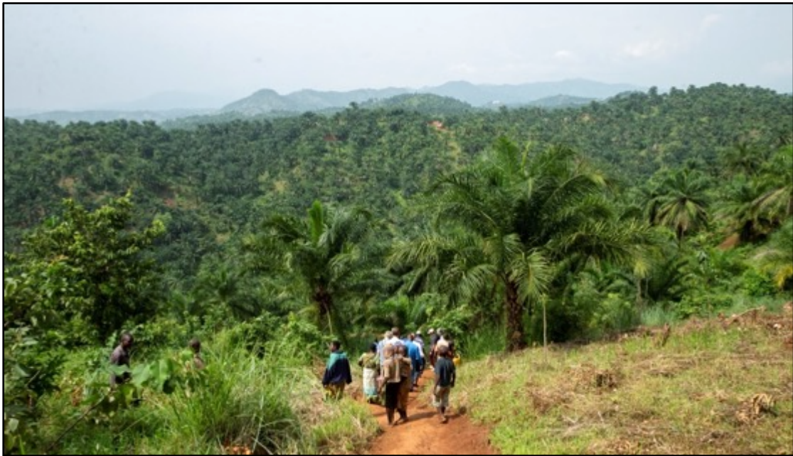
A palm plantation in Rumonge province. The armed opposition group RED-Tabara claimed it clashed with security forces in Bugarama commune, Rumonge province, on 23 August 2020.

BHRI was unable to confirm the identity of the assailants or the number of casualties, but residents and military said that serious fighting took place, for several days, in the hills around Gahuni in Bugarama commune . A member of the military said: “The fighting was intense all day between the rebels and police and military who came from all (military) regions. My colleagues who were on the ground confirmed that the armed group was well organised.” He said he came across several groups of Imbonerakure armed with machetes. 154