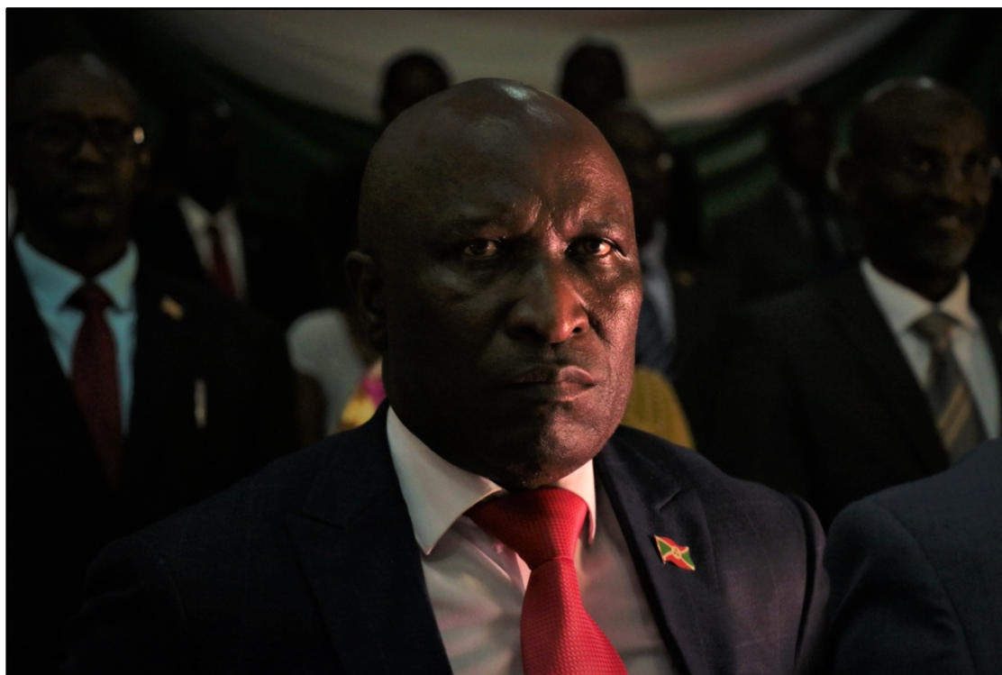
Gervais Ndirakobuca, minister of interior, community development and public security, prepares to be sworn in on 30 June 2020 at the National Assembly in Bujumbura.

A military source who participated in the operation against the combatants said that Ndirakobuca was present during the fighting and that, along with other police officials, he fought alongside the Imbonerakure and military who clashed with the armed men. 77