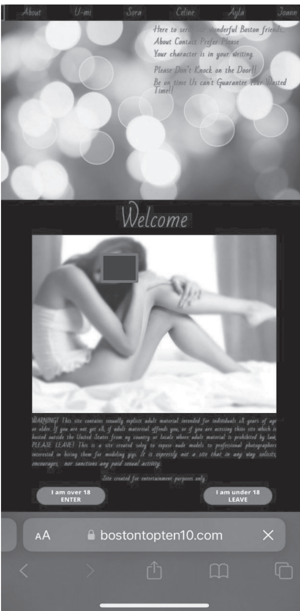
Figure 2: Screenshot of landing page