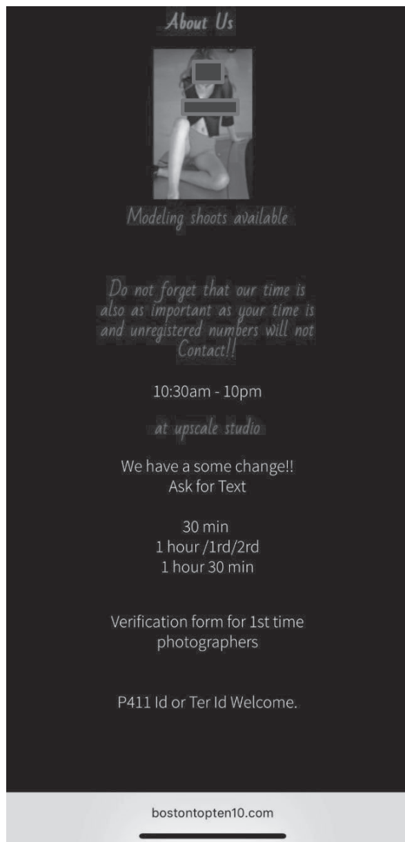
Figure 3: Screenshot of "About Us"

17. As depicted in Figure 3, the website lists times of services as “30 min;” “1 hour/1rd/2rd;” 9 and, “1 hour 30min.” The site typically advertises the services of three to five Asian women at any given time, though there are periods when less or more women are advertised. Women who have appeared on www.bostontopten10.com have also appeared on