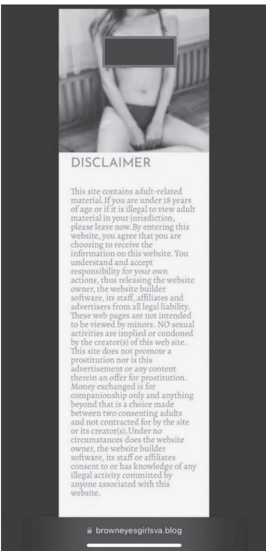
Figure 4: Screenshot of landing page