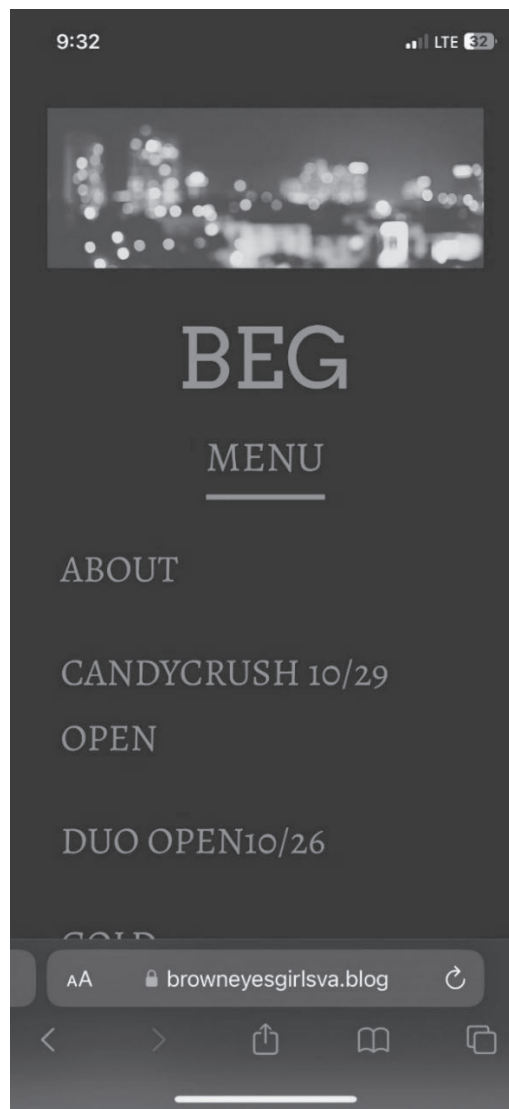
Figure 5: Screenshot of Menu

20. Like Boston Top Ten, the Brown Eye Girl website also lists the height, weight and bust size of multiple Asian women available for appointments and depicts nude and/or semi-nude photographs of each. The women available on the website are updated frequently. For example, on June 3, 2023, the website contained measurements for and nude and/or semi-nude photographs of “Haruka.” On October 20, 2023, the website’s contained measurements for and nude and/or semi-nude photographs and listed: “Fia-K”, “J.Naru/Hanako”, “La Sera” and “Rainbow Open 10/18.” Based on this, I believe that these were the women available for commercial sex for a fee on the date of October 20, 2023. I further believe that the website listed: “Rainbow Open 10/18”