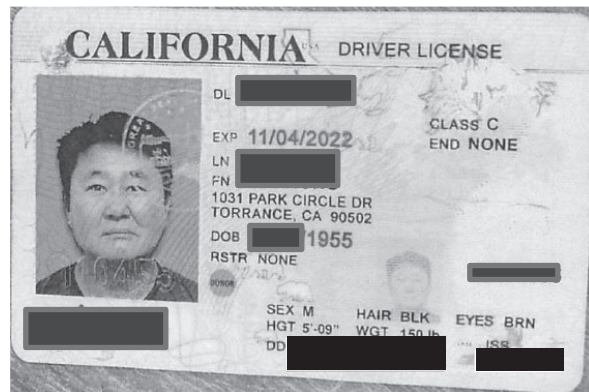
Figure 7: L.H.K. driver license