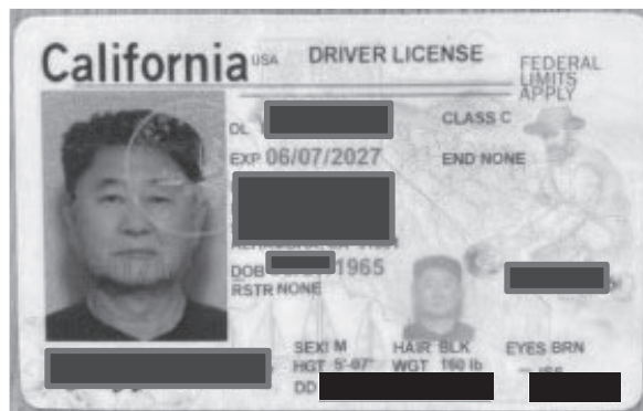
Figure 8: J.G.W. driver license