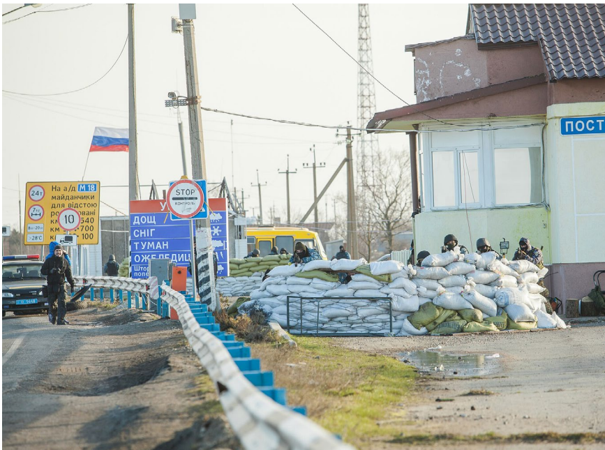
Pro-Russian forces participate in the illegal seizure of Crimea in March 2014. This operation is a quintessential example of a successful fait accompli .

Before Russia demonstrated that long wars and attritional conflict remain possible, only a few Western analysts considered what protracted conflict might look like in the 21st century. 17 The approaches of “distant blockade” and “offshore control” scratched the surface. 18 However, they did not fully consider the implications of protraction and instead sought lower-risk, indirect solutions to an inherently high-risk challenge—a potential war with the PRC. Recent studies have more fully considered the potential implications of a “long war” with the PRC, 19 but no study has fully grappled with reasons behind the increasing chances for protraction.