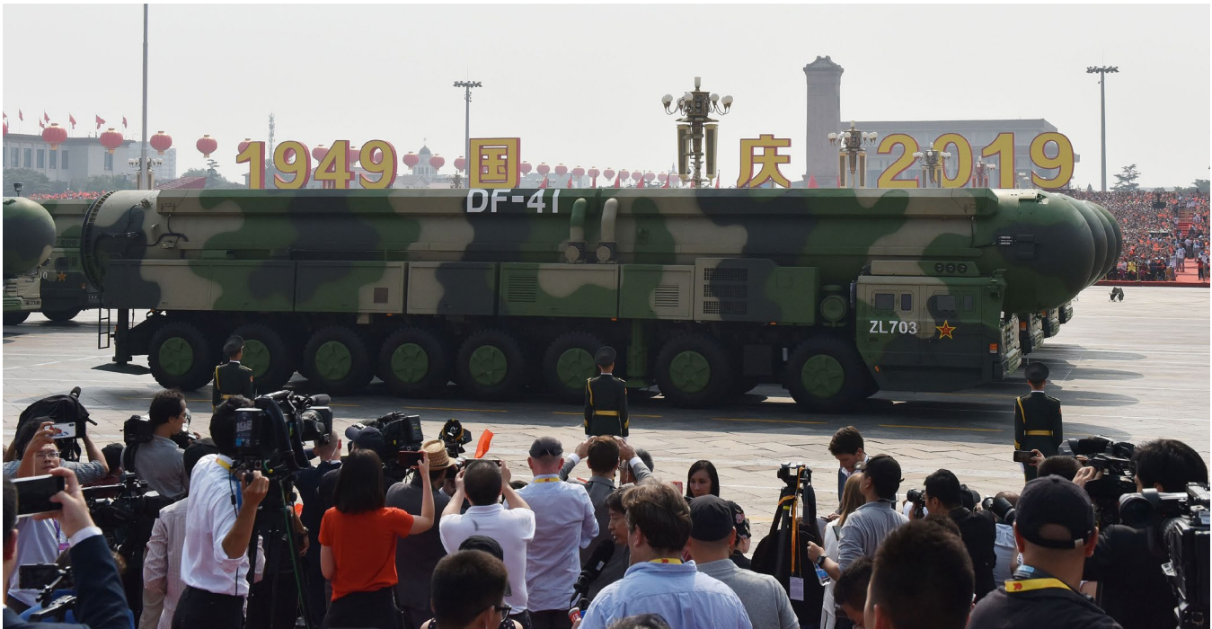
New ICBMs are paraded for the 70th anniversary of the PRC's founding. As the PRC's nuclear arsenal grows in quantity and capacity, it is likely to take on a greater role in shaping China's strategic relationships.

favorable crisis termination. 145 The United States and the PRC likely would seek to control escalation while simultaneously maintaining escalation dominance. This paradoxically constrains and accelerates the conventional conflict. The conflict constraints—the limits on acceptable conventional targets—are in direct tension with the previously described operational concepts the PRC and the United States favor, which stress strikes against command, control, and information systems. The conflict accelerants, conventional vertical escalation to maintain war control, are drivers of conflict expansion. Taken together, this form of escalation management is a major characteristic of protraction.