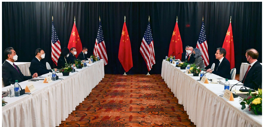
U.S. and PRC leadership have engaged in periodic, often contentious diplomatic exchanges to include the March 2021 meeting in Alaska pictured here. Some negotiated settlement almost certainly would be required to end a conflict.

Furthermore, the illusion of technological transparency is actively undermined by information warfare. Prior sections described the PLA's approach to future conflict with its heavy emphasis on corrupting information or stopping its flow between U.S. forces. The United States also is considering the importance of information warfare in future conflicts. 169 The Air Sea Battle concept explicitly detailed a blinding campaign that targeted PLA satellites and other sensors aimed at degrading the PLA's ISR capabilities for both offensive and defensive reasons. 170 PLA and U.S. approaches reduce, potentially dramatically, the absolute ability of each side to actively perceive the battlespace and gain new information. Such approaches further corrode leaders' ability to accurately understand the course of a conflict.