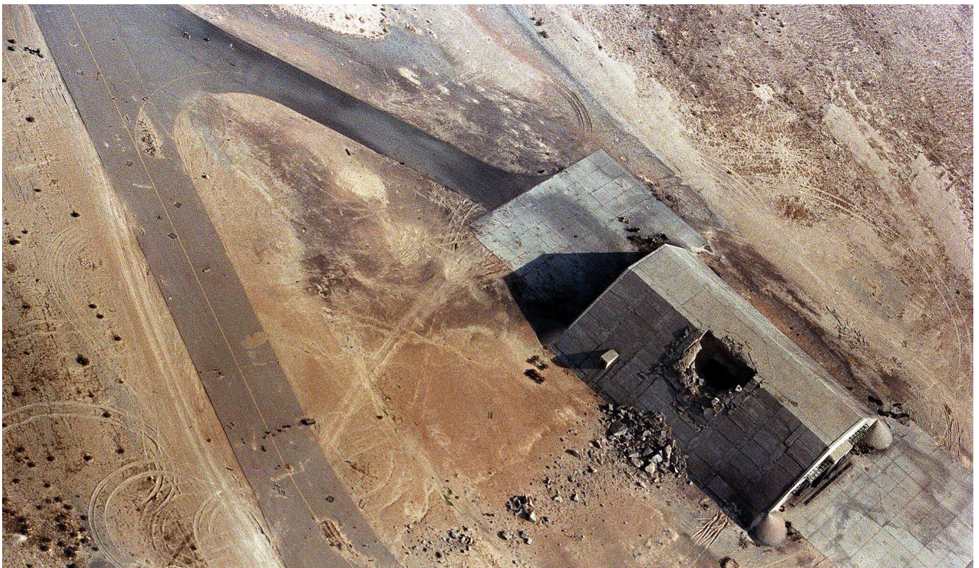
Precision weapons allowed coalition forces to rapidly destroy Iraqi resistance during Operation Desert Storm in 1991. This Iraqi hardened aircraft shelter was destroyed by a single bomb.

The PSR was not limited to land warfare. It dramatically amplified airpower’s effectiveness by transforming the airpower paradigm from needing multiple sorties per target to striking multiple targets per sortie. 50 It also impacted naval combat, supercharging the impact of antiship missiles, and created a far more dangerous environment for surface ships. The United States achieved “accuracy independent of range,” massively increasing the lethality of its military, while simultaneously reducing risk to its force. This is the true promise of the PSR.