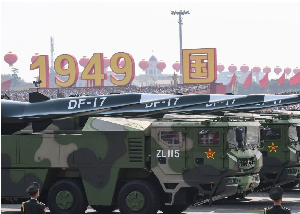
The PRC’s military capabilities have expanded dramatically over the past 30 years. Long-range missiles, such as the DF-17, would play a key role in any PRC military operation in the Western Pacific.

Ultimately, this study is envisioned as the first step in a larger intellectual effort. It does not claim to possess answers to many of its questions. The chief recommendation of this effort is that U.S. defense planners and strategic analysts must broaden their focus. Collectively, U.S. strategic analysts must become more adept at thinking through the various pathways leading to protraction as well as the elements of conflict and competition that will set us on these paths. Against an opponent with China’s military and industrial resources, rapid victory is increasingly unlikely.