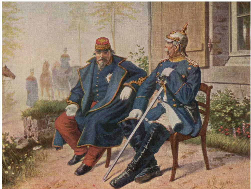
The victorious Prince Otto von Bismarck meets with the defeated French Emperor Louis Napoleon III following the latter's defeat at the Battle of Sedan in 1870. The Franco-Prussian War (1870–71) conformed to the Clausewitzian ideal.