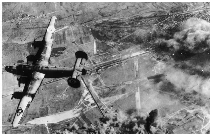
A U.S. B-24 Liberator bomber returns to base after a mission striking German targets. Despite heavy attacks, German industry was surprisingly resilient over the course of World War II.

In the quest for decisive conventional victory, the use of relatively scarce resources in the pursuit of immediate tactical objectives does not translate into strategic victory. The consumption of these resources leads to the next characteristic of protraction. Joshua Rovner observes that a state must be able to recover relatively free from attack if a conflict is to protract. 130 Belligerents need a safe haven, sanctuary, to withdraw in the lulls between battles and campaigns to rebuild the capacities and capabilities for combat. Sanctuary is not an absolute as a state can still come under attack. However, it must still be able to meaningfully rebuild its forces for sanctuary to exist. Without this, protraction is increasingly difficult, as one or both belligerents simply will run out of the tools to continue the conflict. 131