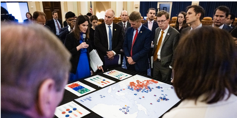
Members of Congress consider their options during an April 2023 CNAS wargame. Wargames are a key tool for considering the implications of future conflict.

For conflicts to protract, one or both parties must simply decline to "give up." Even if the PRC were to be denied its initial war