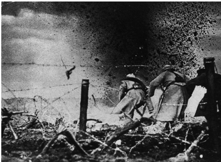
French troops going “over the top” and advancing. World War I stands as a stark reminder as to what can happen when pre-conflict expectations meet the realities of war.

The supposed brilliance of early operational designs eschewed Clausewitz’s enduring maxim, that war is but an extension of the political. 80