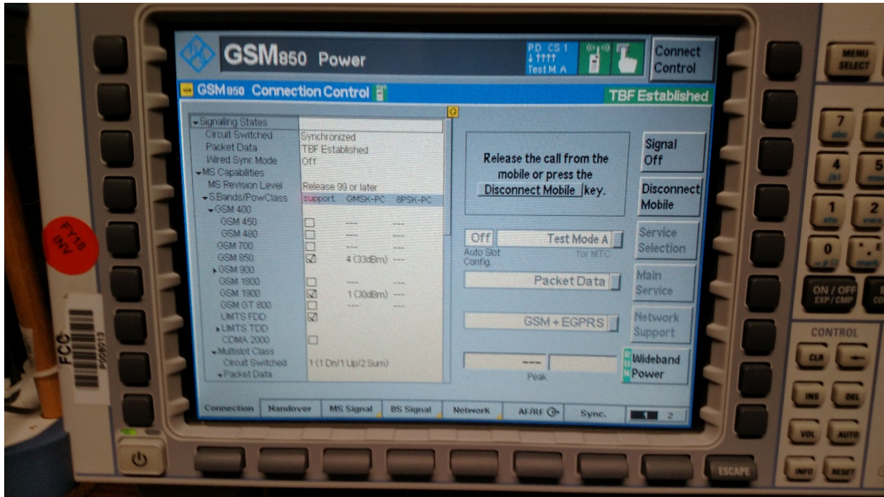
Figure 2: Connection Control Screen of CMU 200