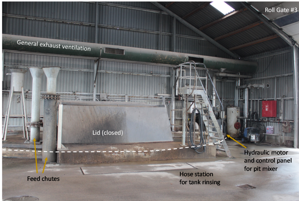
Figure 2 The feedstock pit with the lid closed. Feed chutes are at centre left.. Dotted line shows pit tank contour