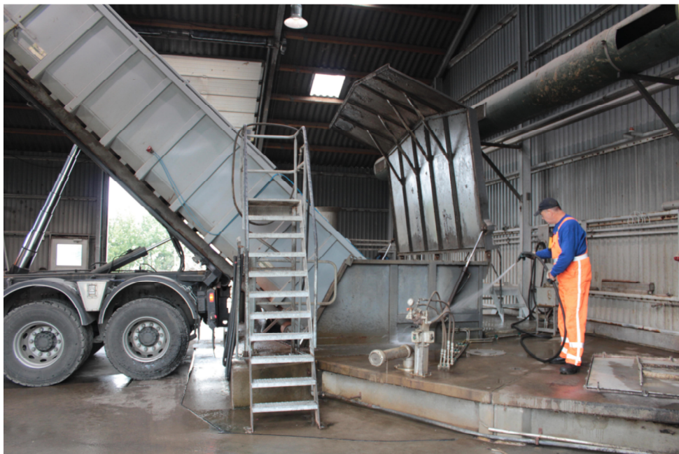
Figure 3 A container tank is hosed down after having unloaded pork abattoir offal (intestines) into the feedstock pit. Note the open lid.