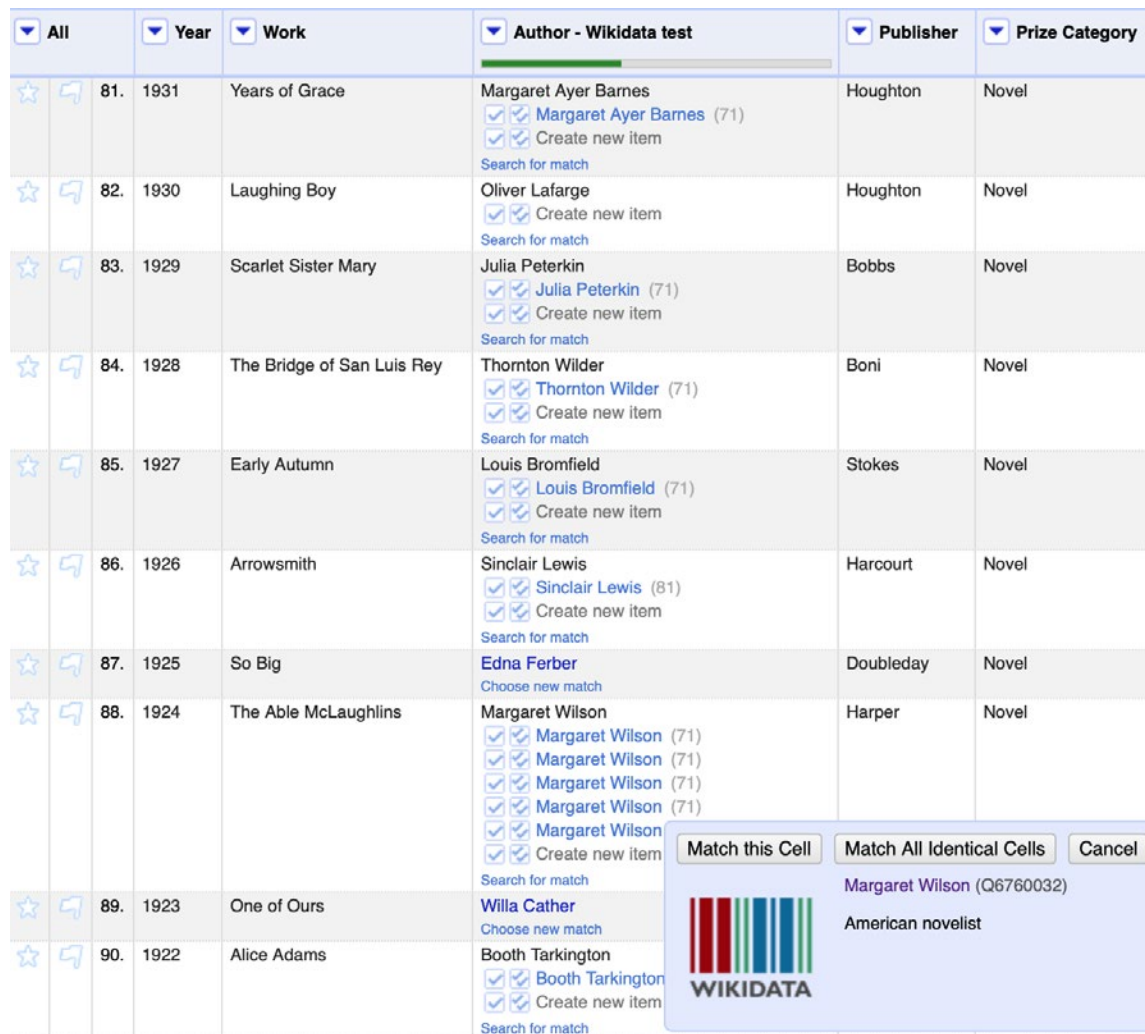
Figure 5. Wikidata reconciliation service in OpenRefine.

QuickStatements allows a user to batch edit Wikidata or Wikibase by importing multiple editing commands (or statements) in a delimited text format. There are tools for generating such statements including OpenRefine, CSV files, and Zotero. The interface takes either tab/newline or comma-delimited data for batch upload into Wikidata and Wikibase. QuickStatements can be installed on a server alongside independent deployments of Wikibase.