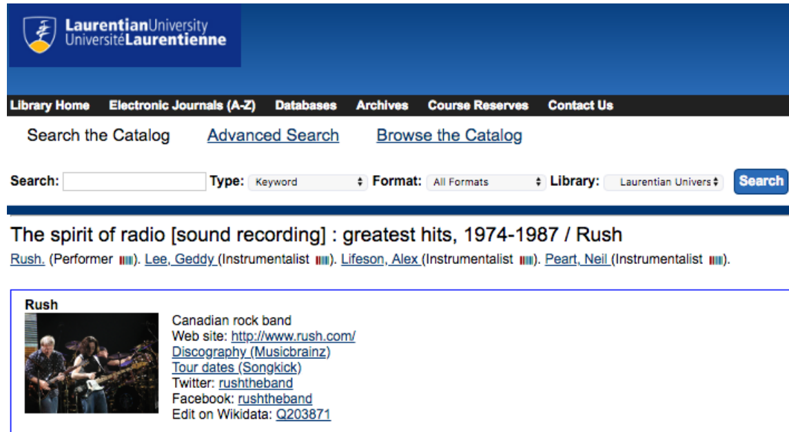
Figure 7. Snippet of a catalog record in the Laurentian University Library ILS (Integrated Library System), Evergreen, where data pulled from Wikidata is used to augment the record.

A similar feature has been rolled out by library technology provider Zepheira, which is creating “About Author” tools for entities represented in the collections of public libraries across the United States. 62 Once linked data entities are matched against Wikidata, a much larger community of reusers can take advantage of that data for discovery applications.