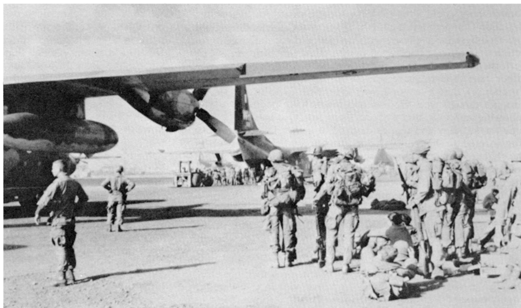
Author's unit waiting to board planes at the Ban Me Thuot Airport for a flight to Pleiku. Note the gear carried by the men.

That operation was unusual. My company normally maneuvered on its own, though not always as a unit. The three rifle platoons frequently were given separate assignments, enabling us to cover more territory. This part of our S.O.P. made sense, providing the platoons remained in supporting distance of each other. That didn't always happen. Long after I was wounded, my former platoon was ambushed; it fought for hours on its own, help being too far away, losing one-third of its men. Yet the reasons behind having the platoons operate individually (like those underlying the rest of our S.O.P.) were never clearly explained to us. The men I knew instinctively disliked the idea. True, they were aware that in theory units were never truly "alone," since they could summon help ranging from nearby outfits to air strikes. Furthermore, we were told that, if wounded, we would never be more than 20 minutes from a hospital. 20 But variables — such as the weather, the number of friendly units in trouble, clamoring for aid — could affect these cal-