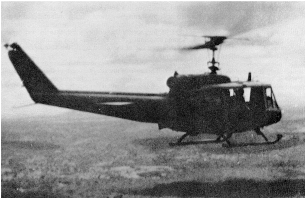
Huey UH-1D, the main troop-carrying helicopter, flying across the plateau country near Pleiku.