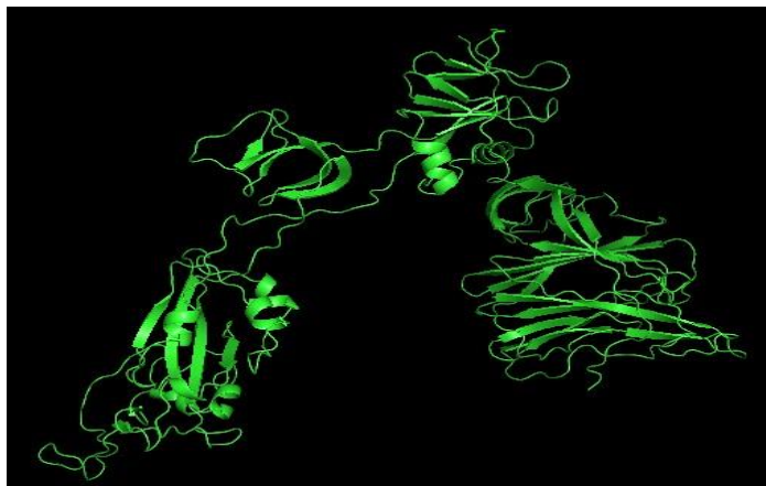
Fig 1: Computational model of Spike2 protein using I-TASSER database. The C-score is about 1.05. The C-score value suggests a reasonable probability of a predicted model

investigated in this work using a computer-aided medication design approach.