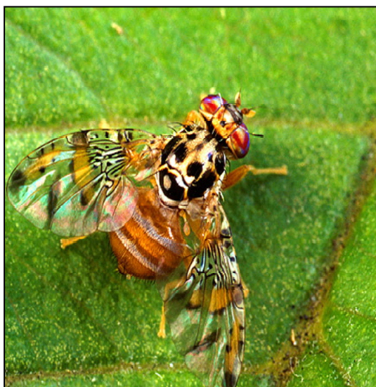
Figure 2. Adult Mediterranean fruit fly.

Rift Valley fever is an excellent example of a disease that would require little effort to deliver to the United