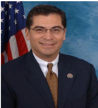
Xavier Becerra Secretary of the Department of Health and Human Services

We the people DEMAND that you refuse to sign the continuation of the Declaration of a Public Health Emergency for COVID-19.