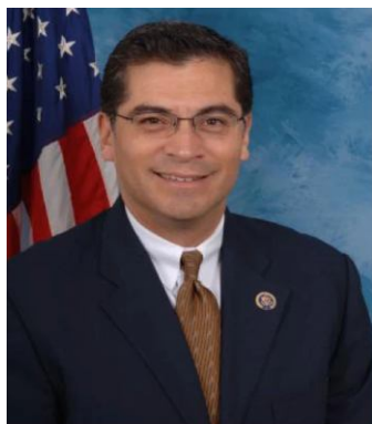
Xavier Becerra Secretary of the Department of Health and Human Services

We the people DEMAND that you refuse to sign the continuation of the Declaration of a Public Health Emergency for COVID-19.