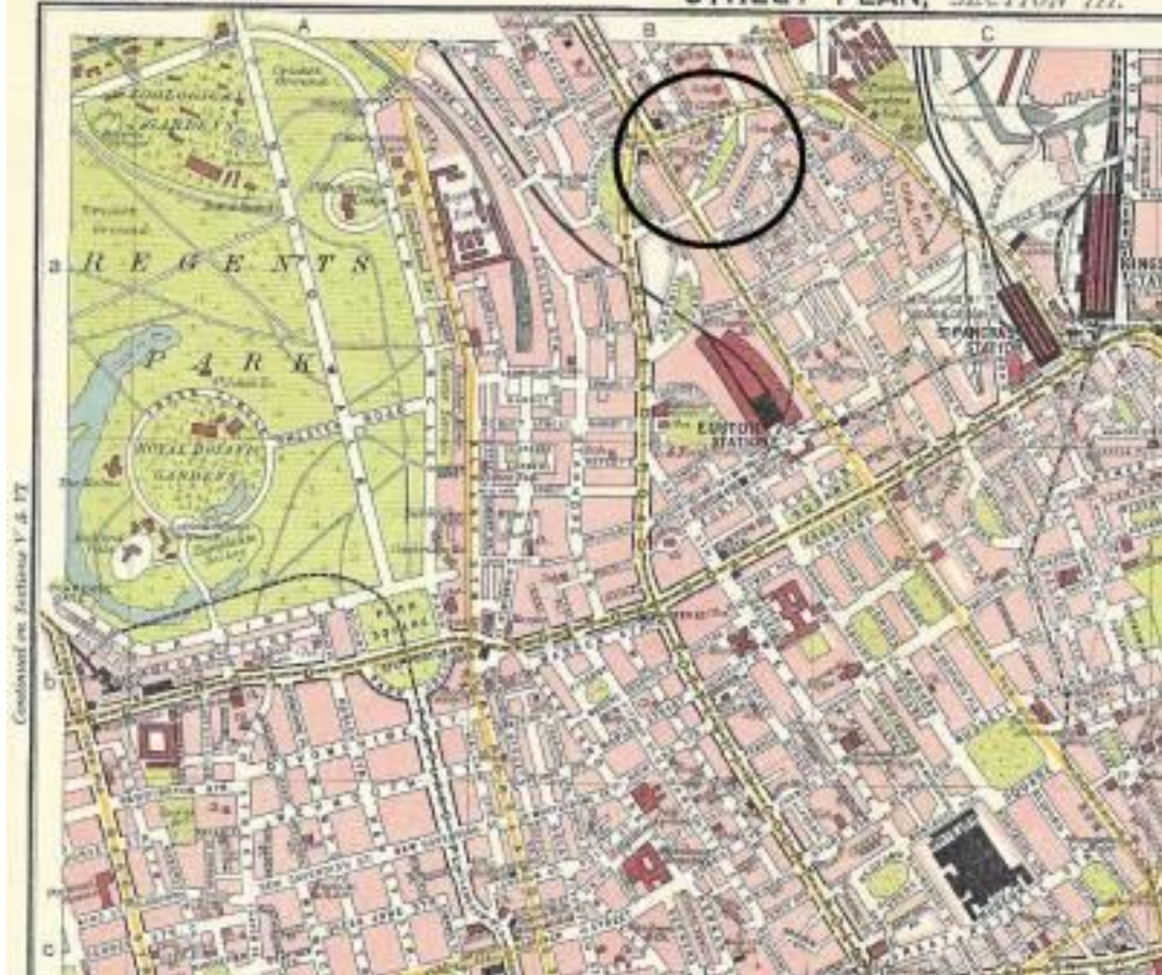
Oakley Square Map, 1917