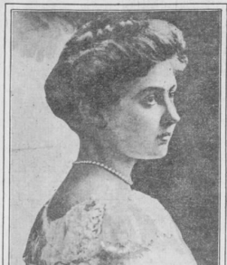
PRINCESS PATRICIA OF CONNAUGHT