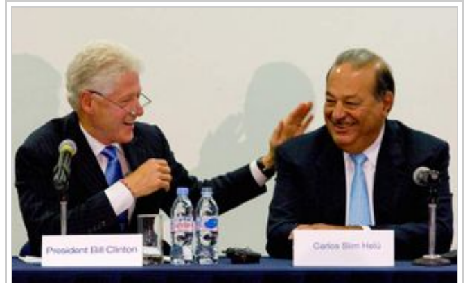
Bill Clinton and Carlos Slim [2] ( http://archive.is/mNQa1 )

Slim has personally donated between at least $250,000 to $500,000 to the Clinton Foundation.[10] ( http://archive.is/wYfRg#selection-1251.0-1263.63 ) Through businesses he owns, however, he has donated over $7 million.[11] ( http://archive.is/wYfRg#selection-1323.0-1389.58 ) Slim also donated a significant portion of a $20 million fund the Clinton Foundation's Clinton-Giustra Sustainable Growth Initiative (which also involves Clinton associate, Frank Giustra), runs jointly with Slim's SLIM Foundation.[12] ( http://archive.is/QGX0i#selection-1171.0-1171.264 )