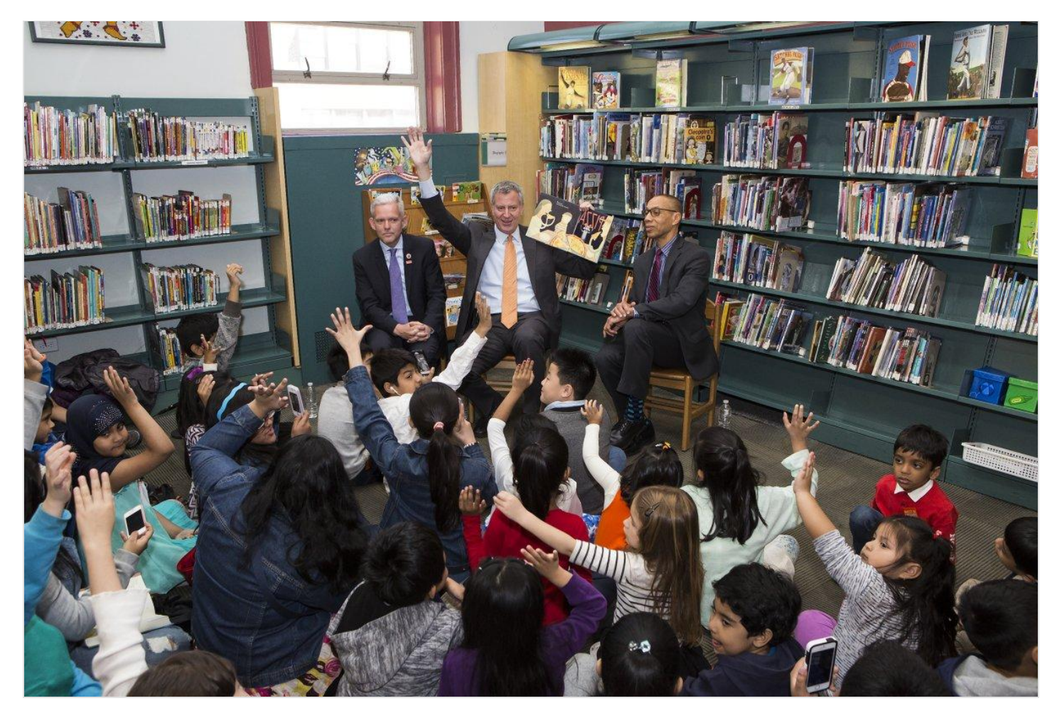
Kids raise their hands after the mayor during the reading.

On Friday, the mayor said that his fund-raising is only under a microscope because of politics — and ripped the election official who pushed for the probe as clueless.