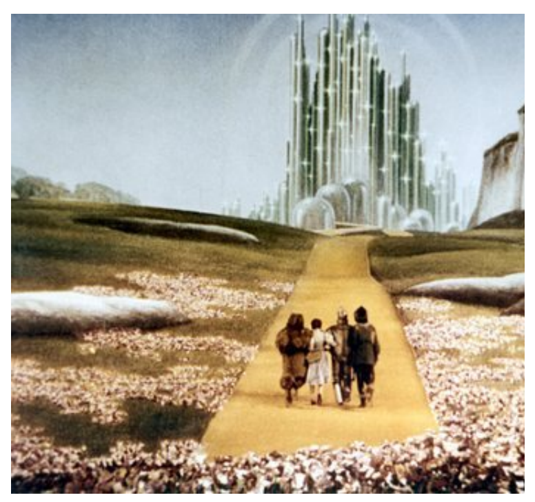
The movie The Wizard of Oz is used by Monarch har program their slaves. Symbols and meanings in the become triggers in the slave's mind enabling easy at the slave's mind by the handler. In popular culture, vereferences to Monarch programming often use analy. The Wizard of Oz and Alice in Wonderland.

population, using subliminals and neuro-linguistic programming and to deliberately construct specific impressionable MONARCH children. [11. Ibid.] Some of the movies used in Monarch programming inc Sleeping Beauty .