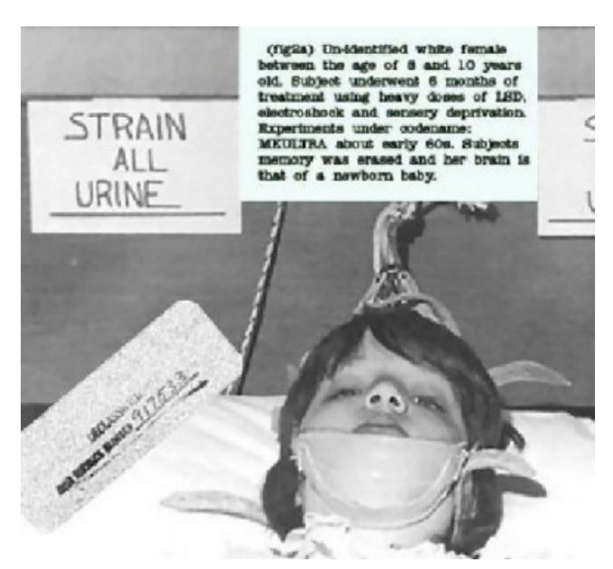
Declassified picture of a young MK-ULTRA subject, 1961.

Although the admitted goals of the projects were to develop torture and interrogation methods to use the project aimed to create "Manchurian Candidates", programmed to perform various acts such as as