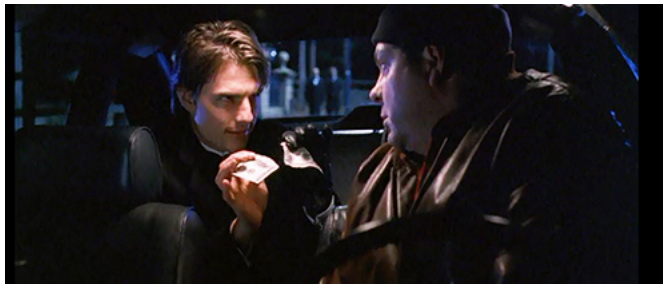
In order to get this taxi driver to wait for him in front of the elite mansion, Dr. Bill tears up a hundred dollar bill and promises him to give him the other half when he comes back. Dr. Bill's motto is probably "Everybody has a price". Does his own wife have a price?

Tom Cruise's character is called Dr. Bill ... as in dollar bill. Several times during the movie, Dr. Bill either waves his money or his "doctor badge" at people to get them to do what he wants. Bill is part of the upper class and his dealings with people of the lower class are often resolved with money.