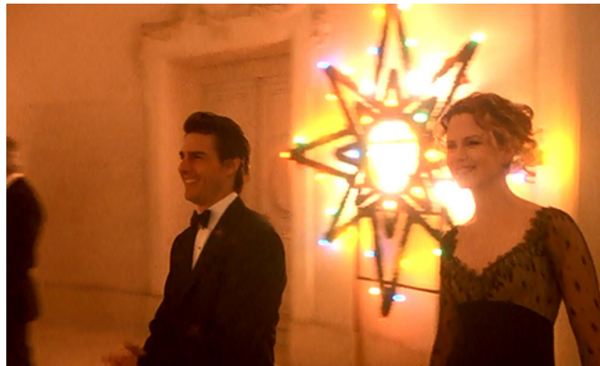
When entering the party, the first thing we see is this peculiar Christmas decoration. This eight-pointed star is found throughout the house.

Bill and Alice go to a classy party given by Victor Ziegler, one of Bill’s wealthy patients. Judging from Victor’s house, he is not simply rich, he is part of the ultra-elite. While his party is very elegant and is attended by highly cultured people, it doesn’t take long for the viewers to realize that this facade hides a disgusting dark side. Also, small details inserted by Kubrick hint to a link between the party and the occult ritual that occurs later in the movie.