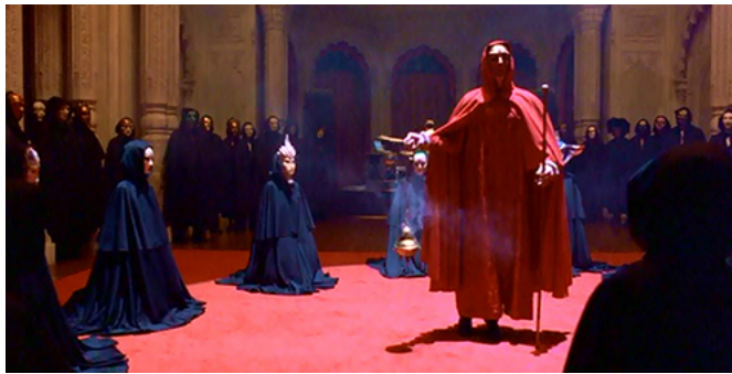
Sharply contrasting with the rest of the movie, Somerton is completely devoid of multicolored lights. Everything about this place is in sharp opposition with the “outside world”.

These lights tie together most scenes of the movie, making them part of the same reality. There are however a few select scenes where there are absolutely no Christmas lights. The main one is Somerton palace – the place where the secret society ritual takes place.