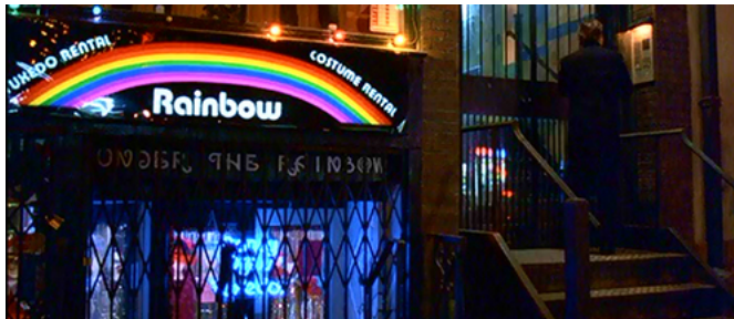
The name of the store where Bill rents his costume is called “Rainbow”. The name of the store under it: “Under the Rainbow”. Kubrick is trying to tell us something...Something involving rainbows.

Rainbows and multicolored lights appear throughout the movie, from the beginning to the end.