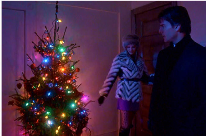
Sometimes Christmas lights are the focal point of attention.

These lights tie together most scenes of the movie, making them part of the same reality. There are however a few select scenes where there are absolutely no Christmas lights. The main one is Somerton palace – the place where the secret society ritual takes place.