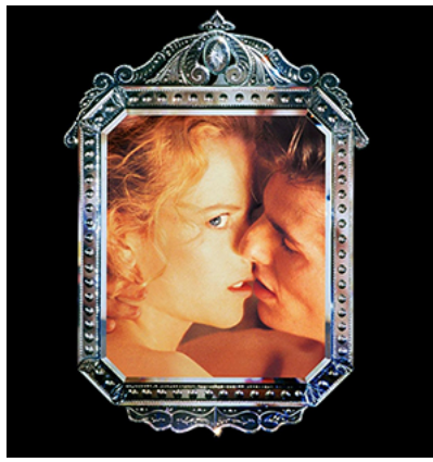
Promotional images for the movie feature Alice kissing Bill but looking at herself in the mirror, almost as if she was seeing an alternate reality.

While the couple shows signs of fatigue, Bill and Alice put on their “happy masks” when it is time to attend social events. Like the elite people they socialize with, there is a big difference between the facade they put on and reality.