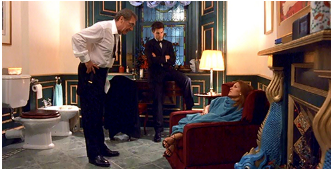
Bill meets Ziegler in his gigantic bathroom. The man is dressing up and is with a naked unconscious woman...who is not his wife.

Bill’s flirting with the models is interrupted when Ziegler calls him to his bathroom. There, we get a first glance of “where the rainbow ends” – the dark truth about the elite.