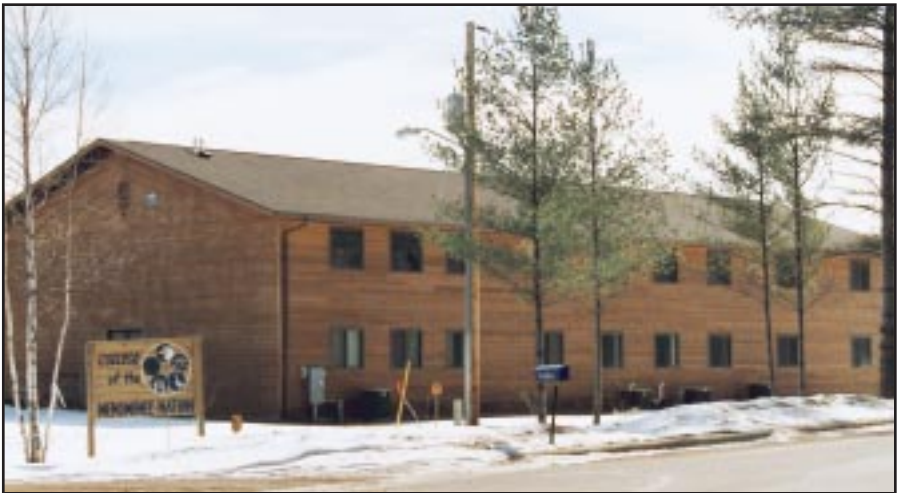
The College of the Menominee Nation is located at the south end of the Reservation at Keshena.

Five primary communities are located on the Reservation: Keshena, Neopit, Zoar, South Branch and Middle Village, as well as several other residential areas. We have two grade schools and a high school. The desire for educational advancement among Tribal members led to the establishment of the College of the Menominee Nation in 1992.