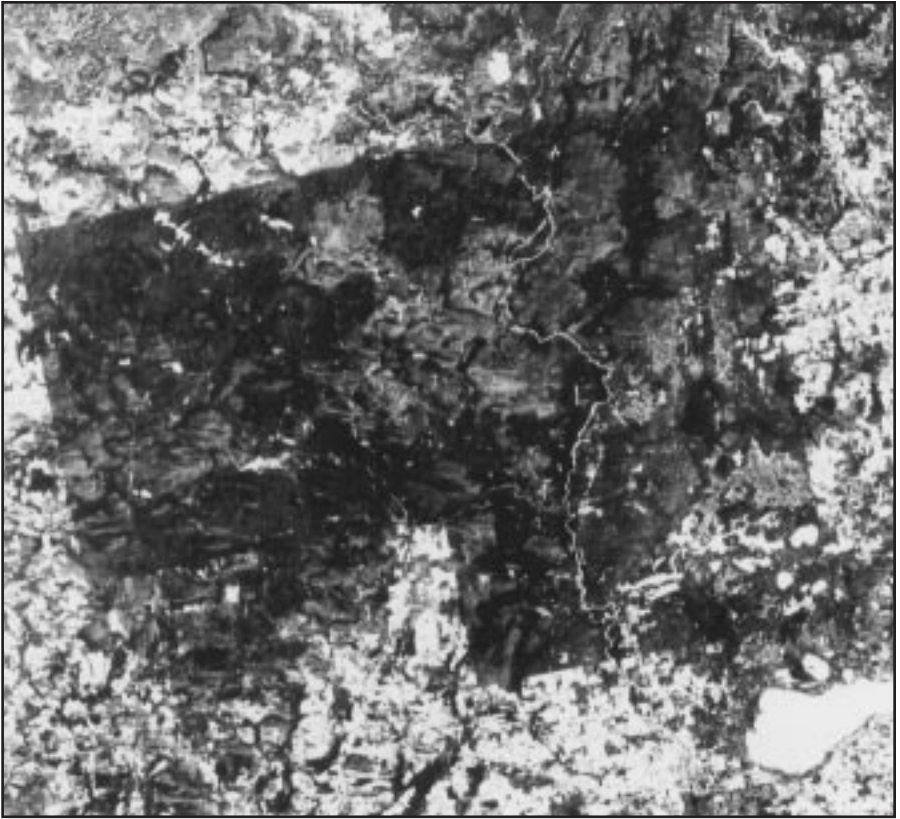
The Menominee Reservation as seen from a NASA satellite. The dark outline shows the heavy timber cover of the land compared to the farm fields of the surrounding counties.