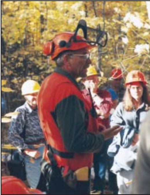
October 1996 Timber Harvesting Systems for Sustained Forest Management Symposium.

The Menominee Indian Tribe of Wisconsin is a federally-recognized sovereign nation, a status which gives us self-governing powers, privileges and responsibilities. We make our own tribal laws and ordinances, and have an established tribal police force and a tribal court system as provided in the Constitution and Bylaws of the Menominee Indian Tribe of Wisconsin .