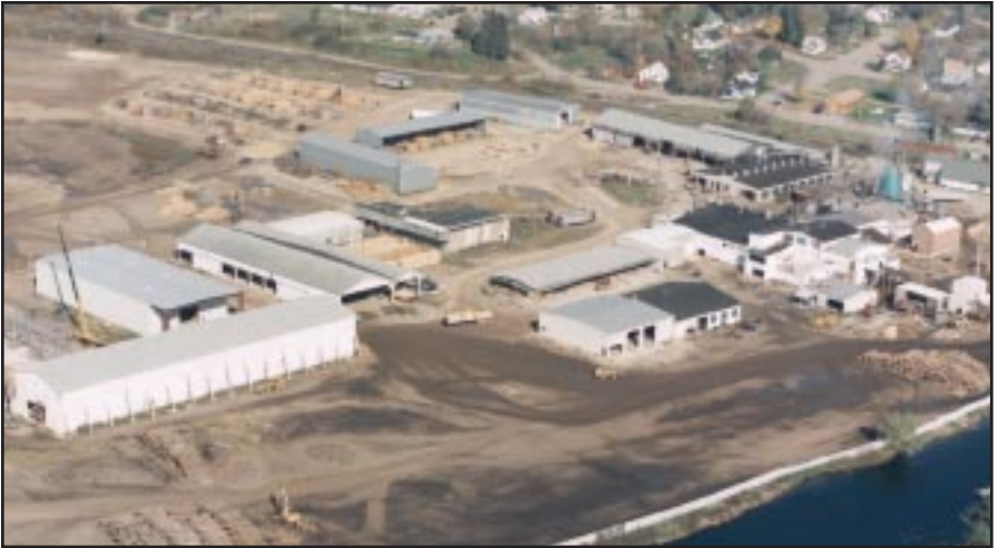
Aerial view of the Menominee Tribal Enterprises sawmill at Neopit.

Falls. Later that same site was the location of the Reservation's first hydroelectric facility. The present mill at Neopit was built in the 1906-1908 period and continues today.