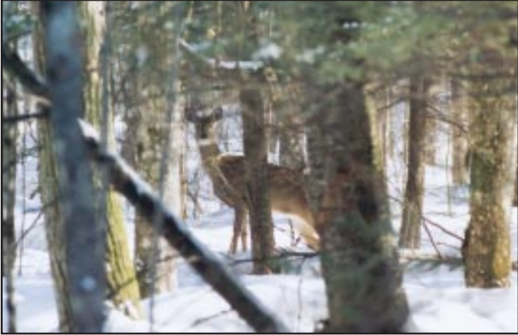
Wildlife abounds in the Menominee Forest

Visitors on guided tours to the Reservation are invited to appreciate our forest, quality wood products, traditional values and culture, and community members as much as we appreciate them.