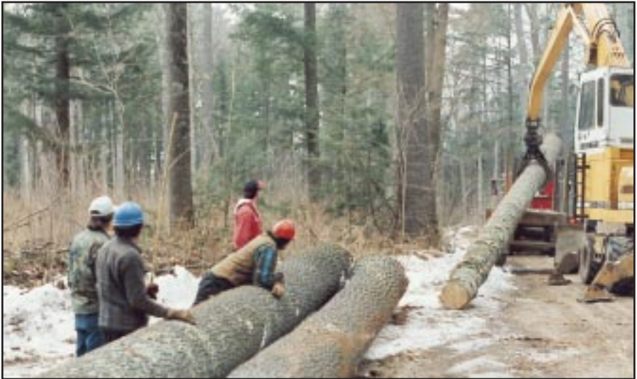
Harvesting White Pine logs for the masts of the Milwaukee Schooner Project.

Foresters evaluate each individual tree for removal. Trees past maturity, of poor quality or that are not likely to survive until the next cutting are harvested. Selection cutting works best for species that can regenerate in full shade like sugar maple, beech, hemlock, and basswood. The selection method results in a forest with all classes of trees.