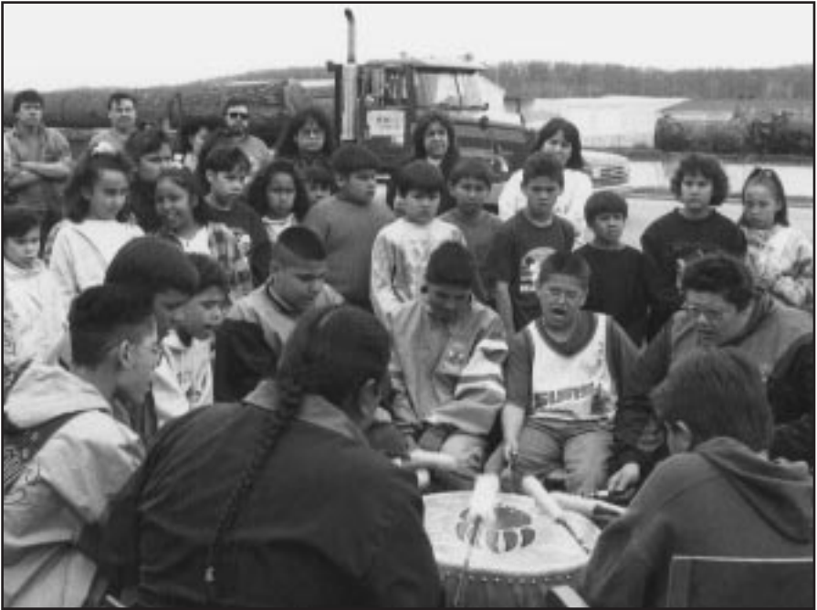
Menominee Tribal School Little Bear Singers offer a song during the dedication of logs which MTE donated as the masts for the Wisconsin Lakes Schooner Education Association Schooner Project.

This bounty cannot be measured in financial terms alone, but must include a balance of environmental, economic, cultural, community and spiritual values. Today celebrate the interconnectedness of the Creator's design so eloquently expressed by Mother Earth on the Menominee Indian Reservation.