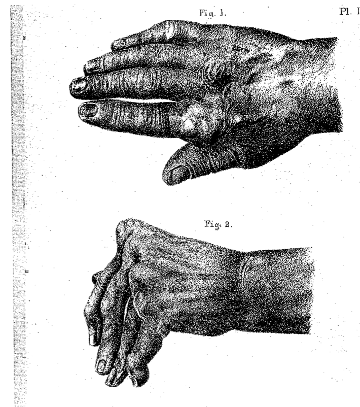
FIGURE 1. Advanced stages of a gout-afflicted hand (top) and arthritic hand (bottom). Detail from J. M. Charcot, Clinical Lectures on Senile and Chronic Diseases (London, 1881), plate 1. Wellcome Library, London.