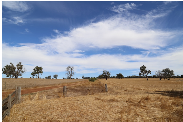
Figure 2. Broomehill, wheat belt of WA.

brothers' farms were all within a few miles of each other, roughly in a straight line between the towns of Flat Rocks and Borderdale ... Italian names prevailed when the brothers selected their properties which bore titles like Sorrento, Etna and Belvedere" (Triaca, 1985, p. 89).