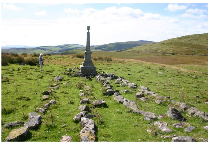
Communion stones at Skeoch Hill