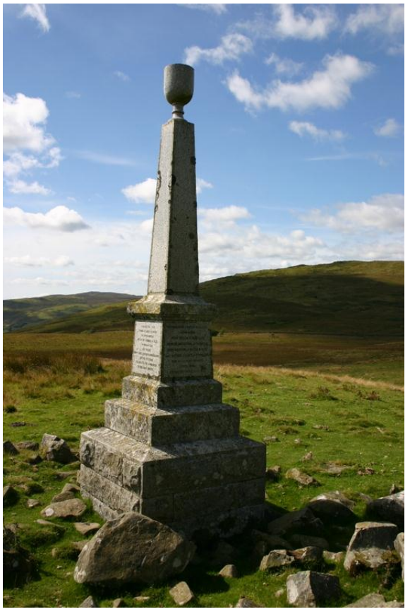
Skeoch Hill memorial

chalice at the top. There are four distinct rows 11 metres long of close set flat stones which are 1.5 metres apart. There is believed to have been a fifth row, but this is no longer in evidence. Two photographs are shown on the next page.