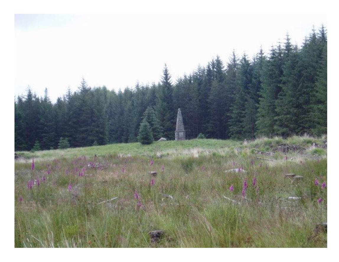
Monument at Auchencloy

It stands on a mound in a small clearing and the gravestone is nearby. Both are inaccessible except to walkers, who need to consult a local Ordnance Survey map. The grid reference is NX603708. The site is approximately 5 km west of Loch Ken and the A762, where visitors should leave at Bennan Cottage and travel along the Raiders Road, looking out for a bridge which crosses the Black Water of Dee at Barney Water. The remote location of this memorial helps to emphasise the countryside that was used by the Covenanters to hold conventicles as well as to move around and avoid the dragoons. But some known conventicle sites were not that remote, e.g. Skeoch and Holy Linn.