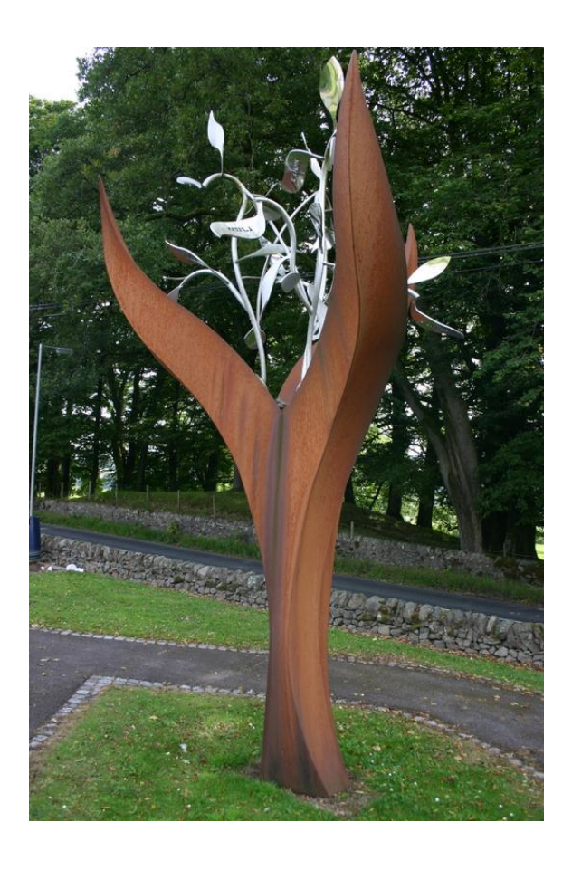
The Burning Bush monument in Dalry

individuals who have gone before us. A photograph is included below: