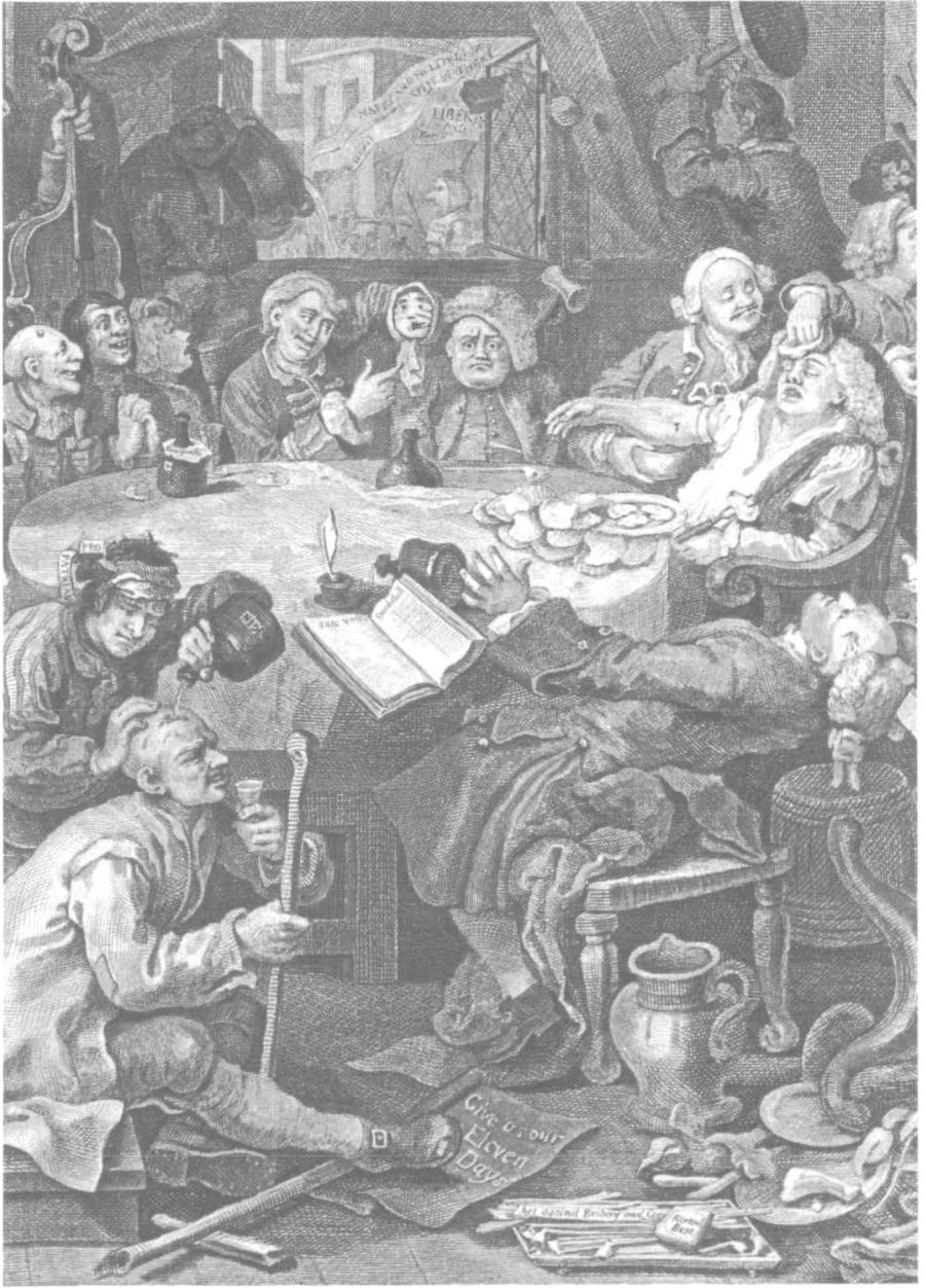
Hogarth, The Election , Plate 1: "An Election Entertainment" (February 1755), detail.