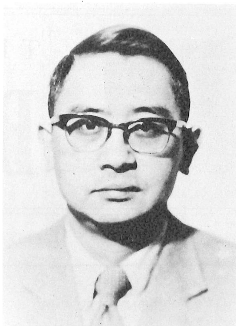
余英時博士 Dr. Yu Ying-Shih

Dr. Yu is Professor of Chinese History at Harvard University, now on leave to serve as President of New Asia College. Prof. Yu obtained his Ph.D. degree from