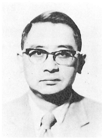
余英時博士 Dr. Yu Ying-Shih