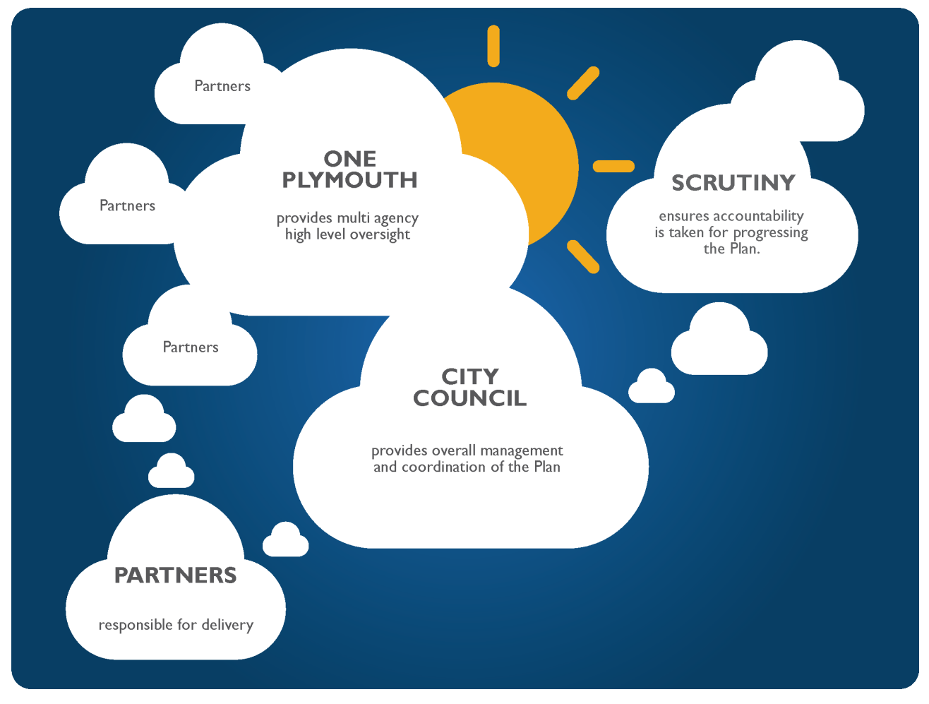
Figure 3 - Plymouth Plan Governance

8.16 The City Council's scrutiny function will be available to provide a structured overview and scrutiny process for the Plymouth Plan.