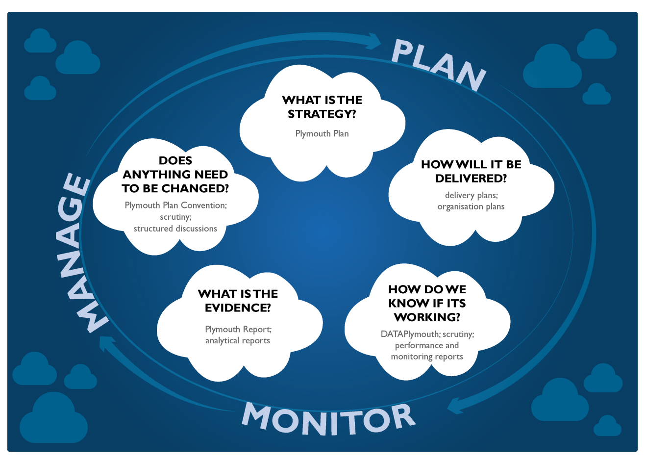
Figure 4 - Plan, Monitor, Manage process

8.23 The system works to financial years, in line with most of the partners. The cycle is: