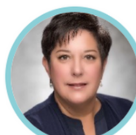
Valerie Sarisky-Reed Department of Energy (DOE)