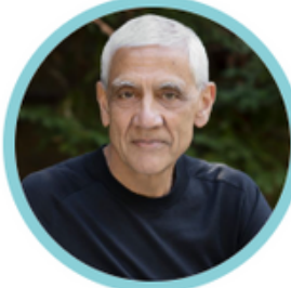
Vinod Khosla Khosla Ventures