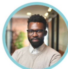
Yves Falanga FyT Consulting Biopharma Solutions: Tools & Technologies