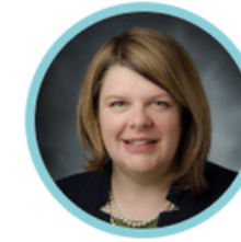
Shannon Hall Pow.Bio Biomanufacturing Scale Up