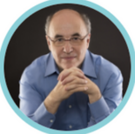
Stephen Wolfram Wolfram Research