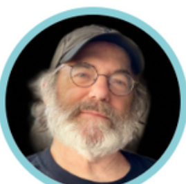
Paul Stamets Fungi Perfecti