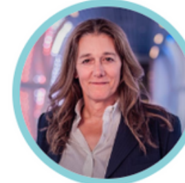
Martine Rothblatt United Therapeutics