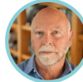
Craig Venter JCVI