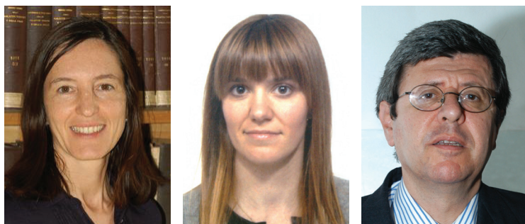
Roberta Rudà 1 , Alessia Pellerino 1 & Riccardo Soffietti *1

First draft submitted: 20 January 2016; Accepted for publication: 22 January 2016; Published online: 17 March 2016