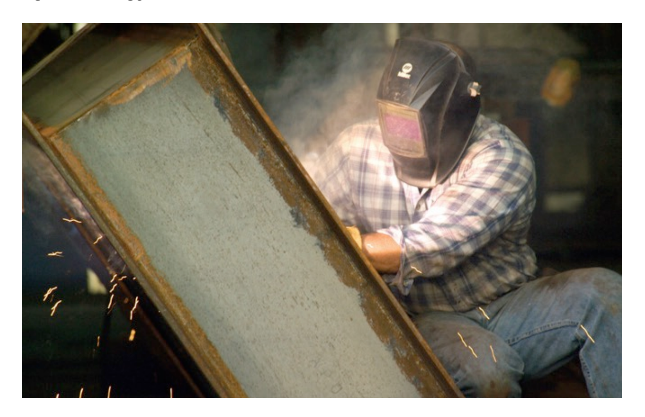
Figure 1: hashing process