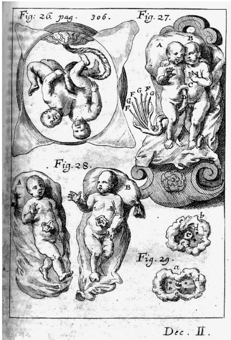
Figure 1 Plate from Koenig (1689).