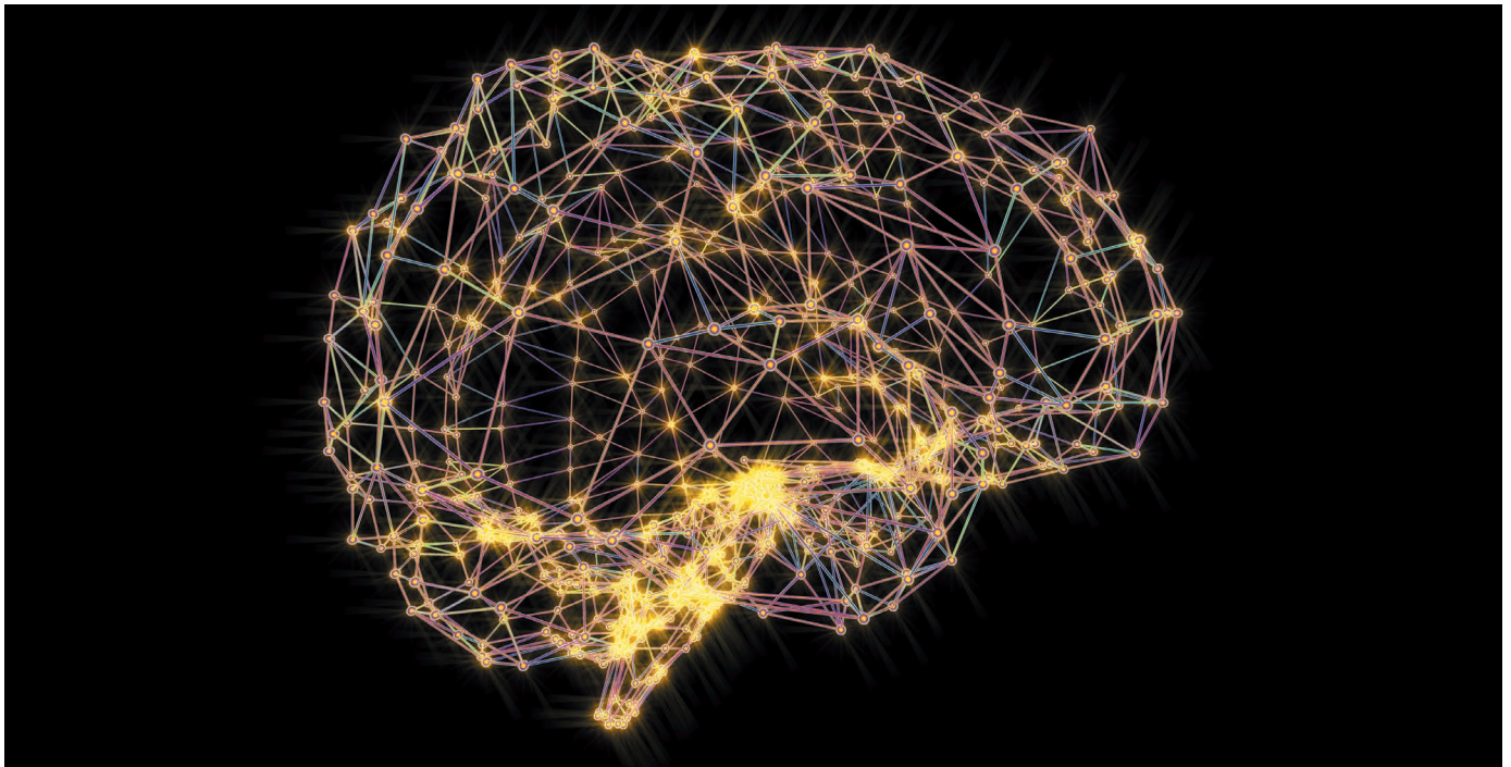
The brain's neural network has long inspired artificial-intelligence researchers.